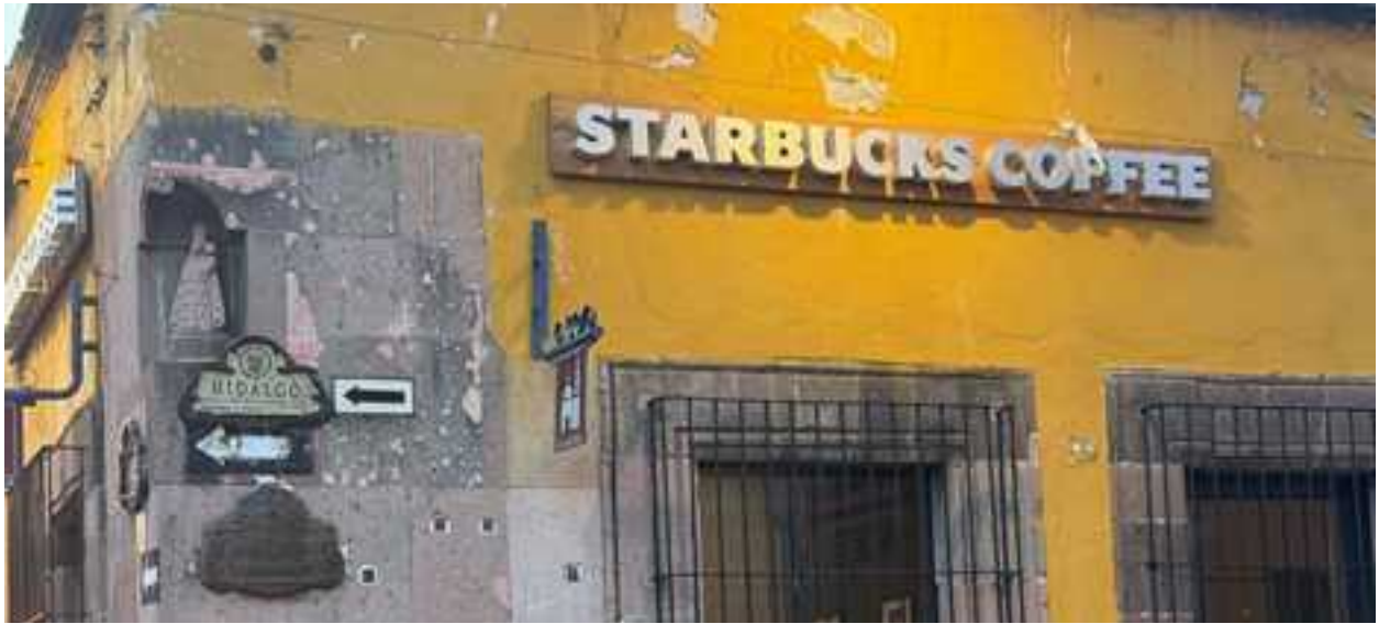
The painted wall at Starbucks needs some love. ;-))