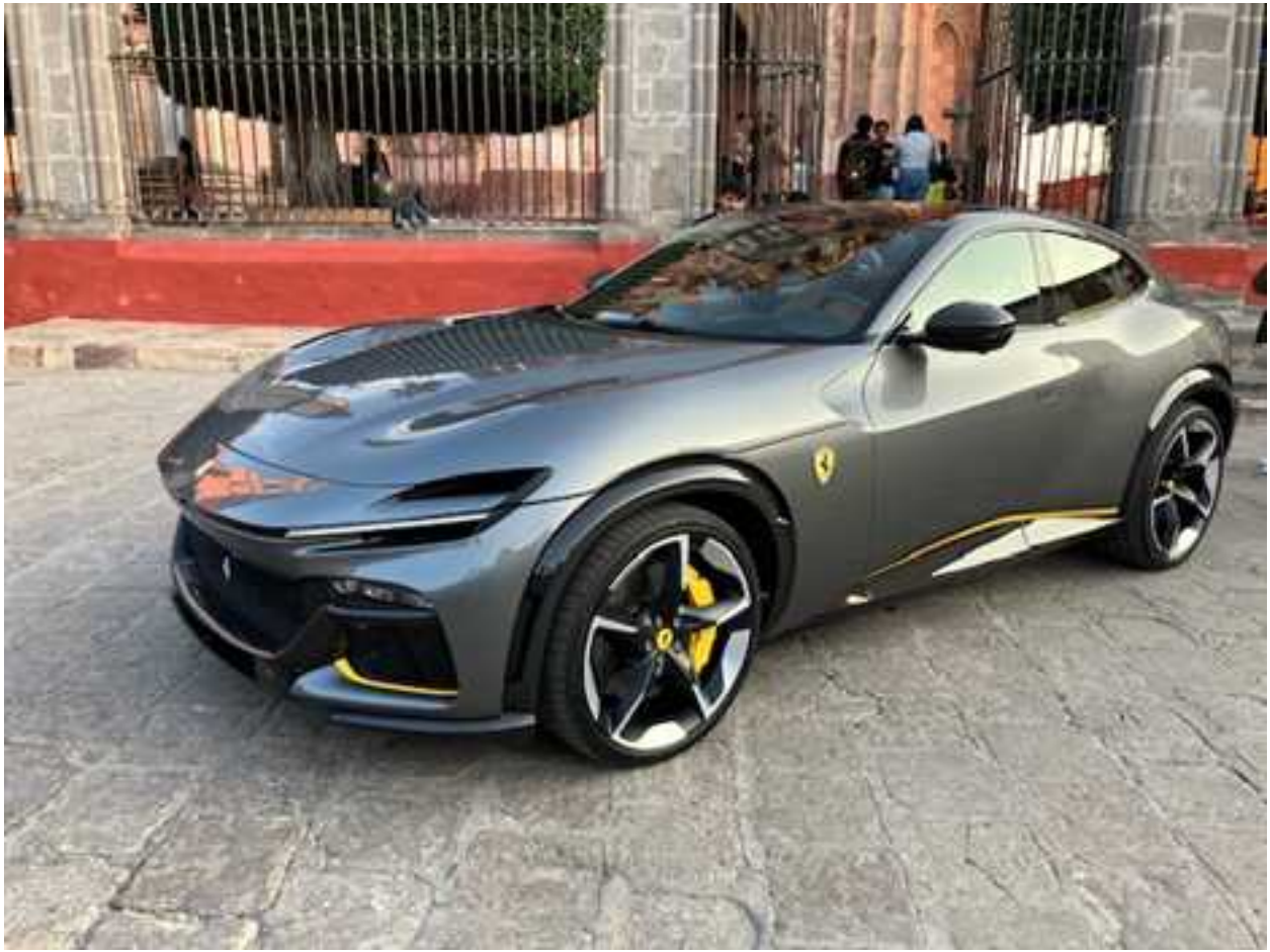
A Ferrari in the Jardín...