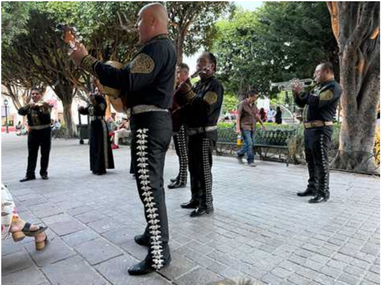
Mariachis sing and play next to us in the Jardin.