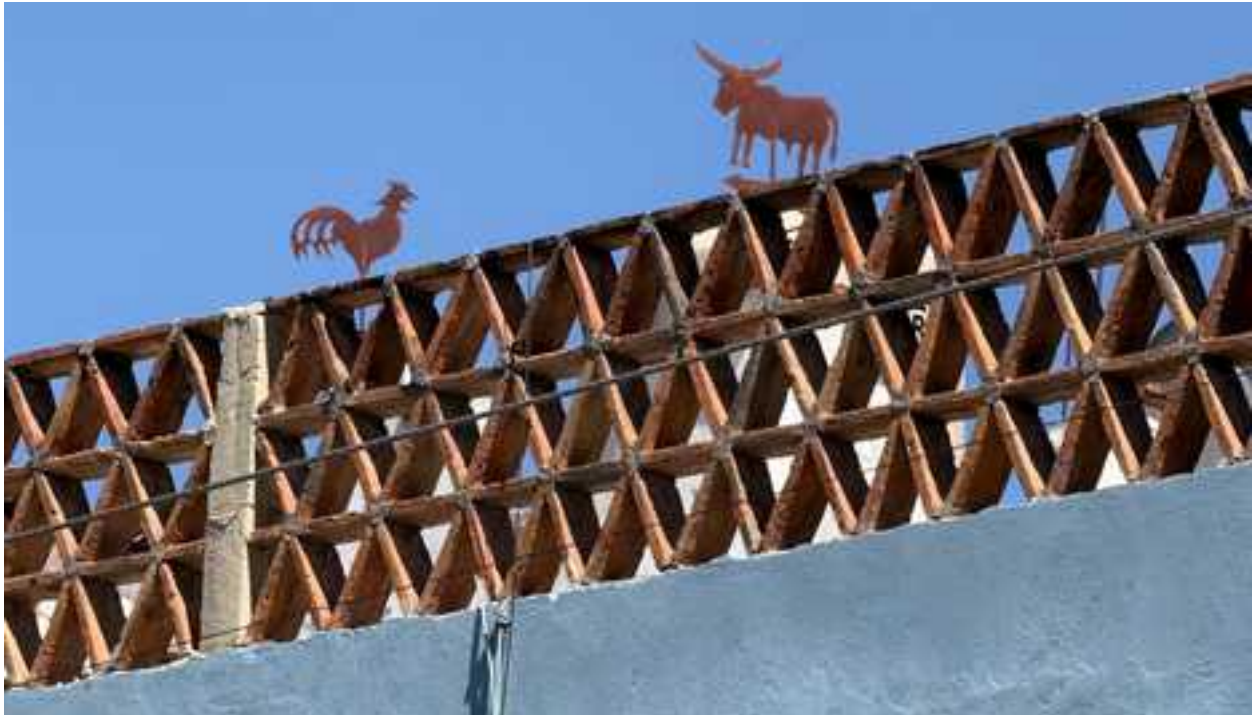
March 3, 2026, 2:02pm : A rooster and a bull on a rooftop. ;-))