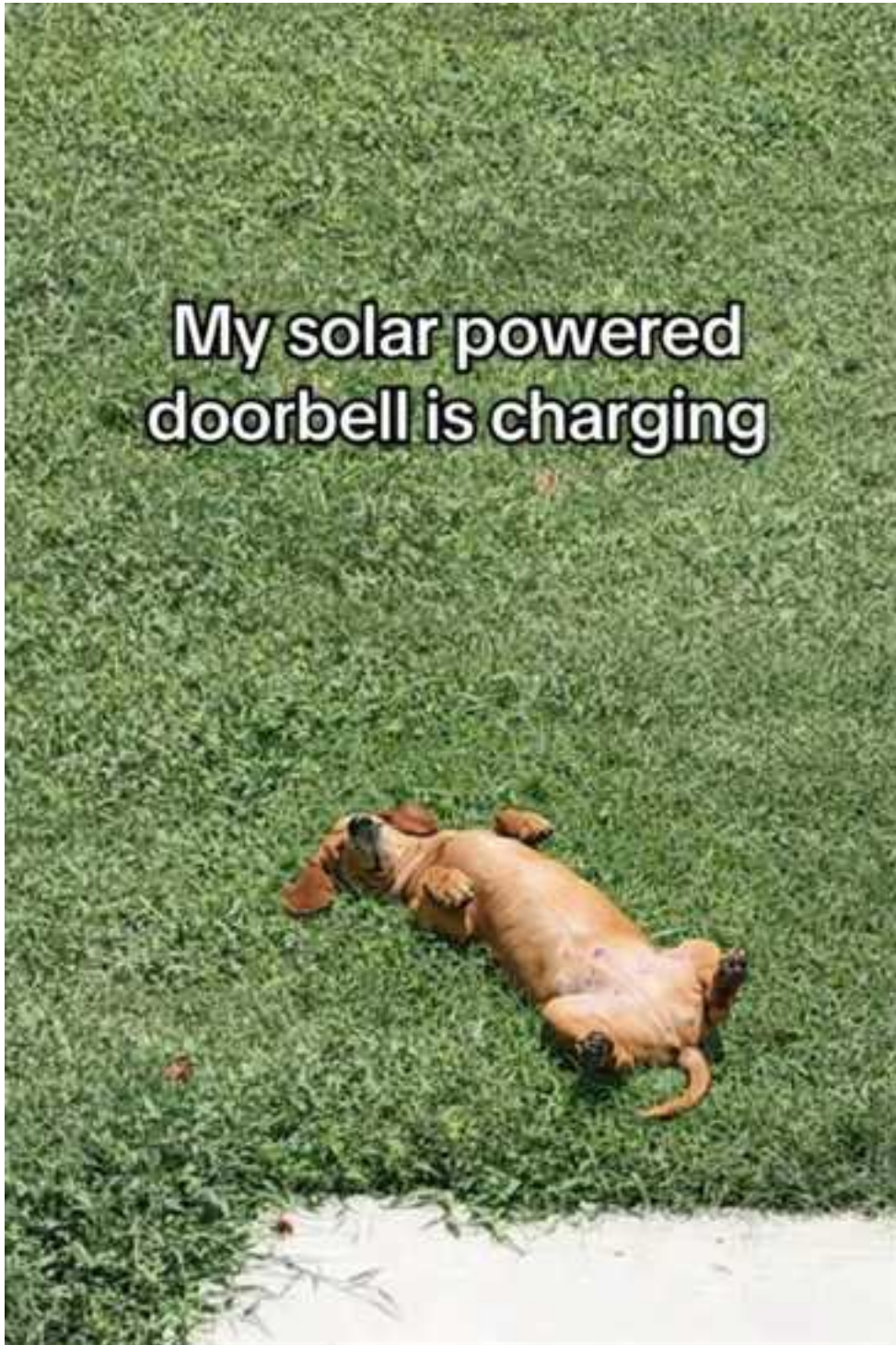
March 4, 2026 : A fun image from a collector. Thank you!