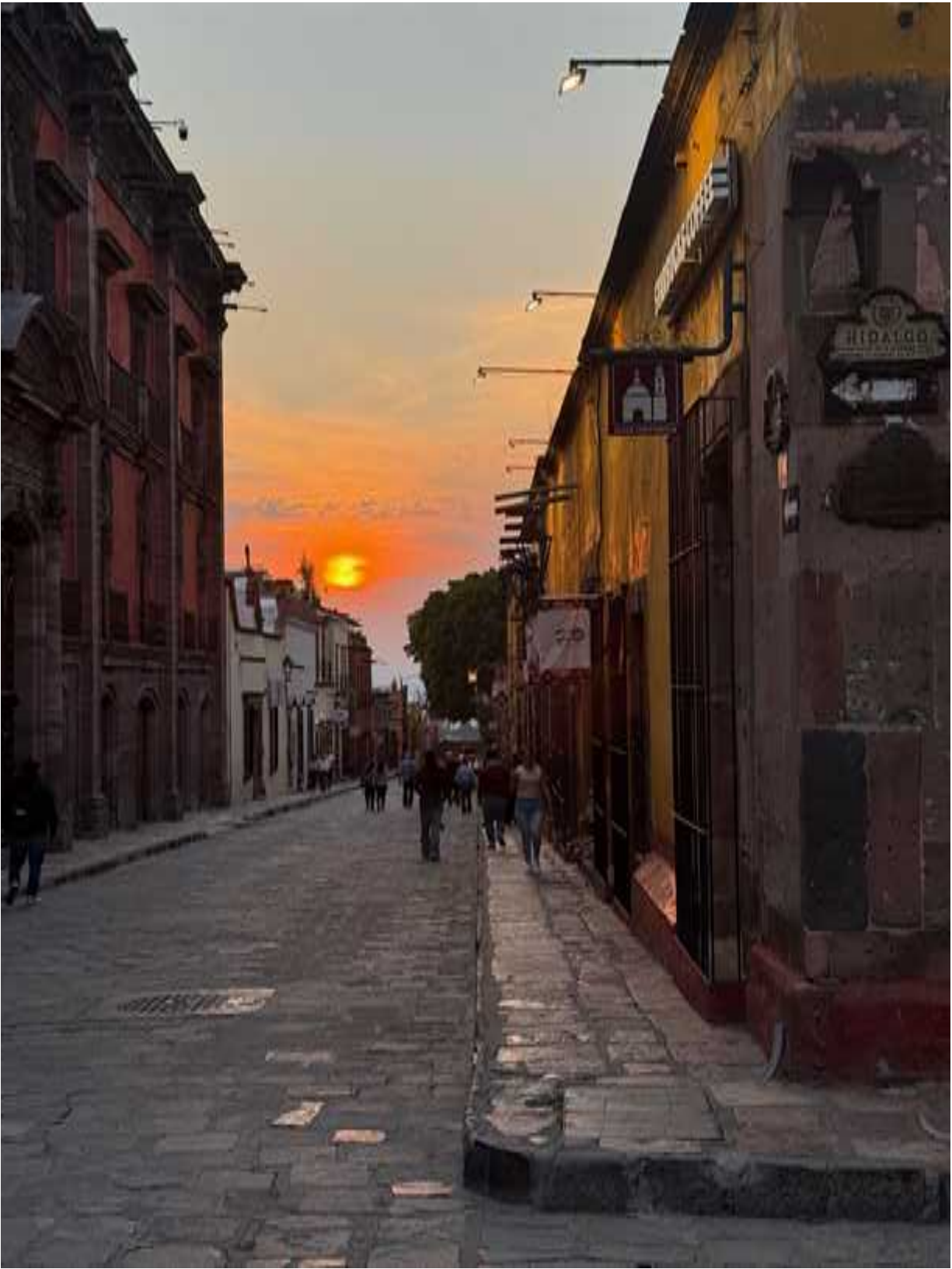
Another glorious sunset at the corner of Canal & Hidalgo.