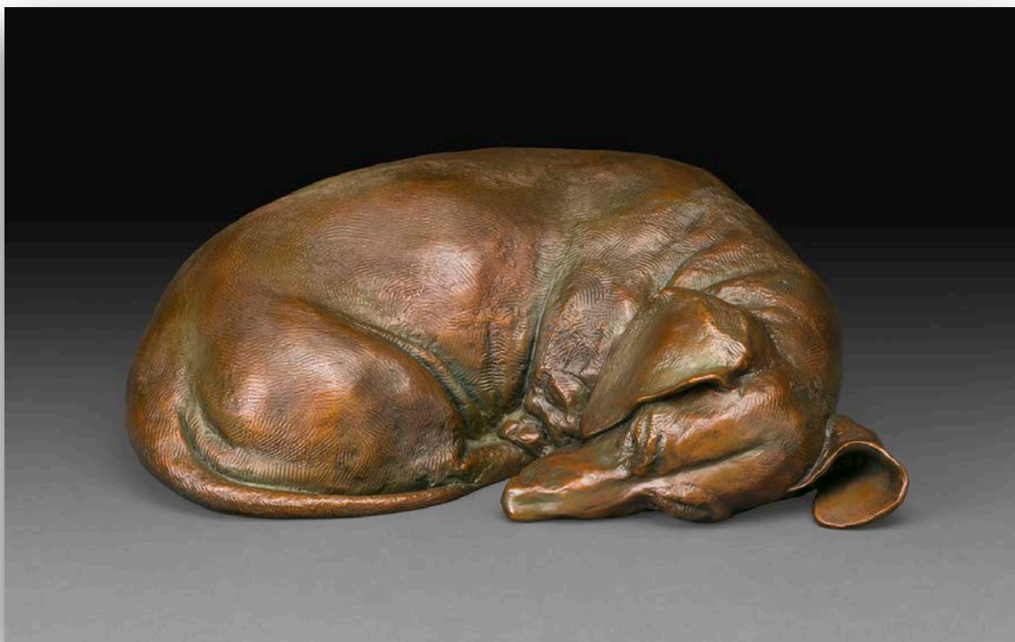
"Dreaming of Tomatoes, Too" MS

Sept. 8, 2022 : Queen Elizabeth II, Britain's longest-reigning monarch dies today at age 96. She was queen for 70 years!