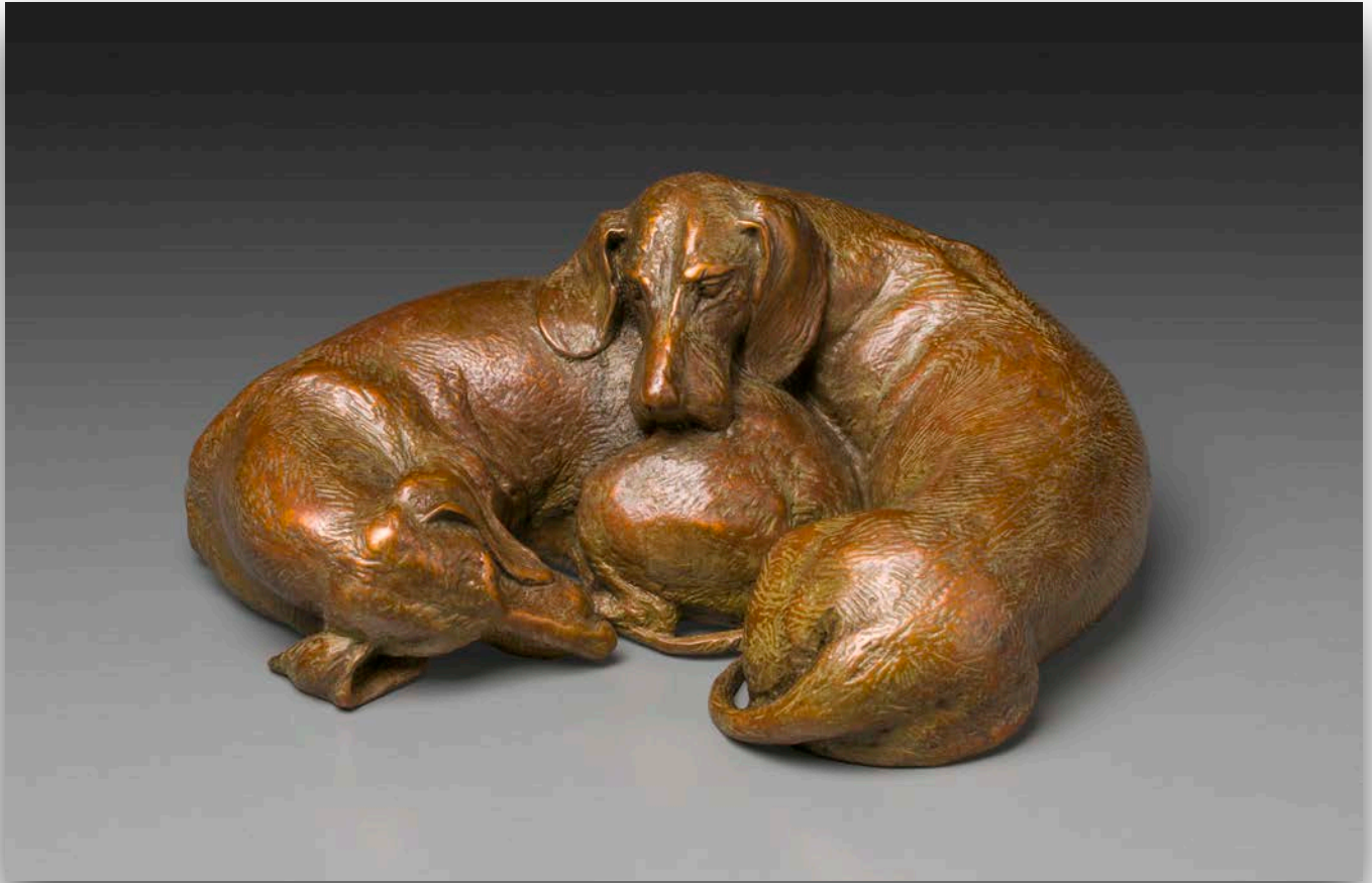
"Cozy" Wire, 1:6 Scale

"Cozy" Wire, 1:6 Scale , earns BEST IN SHOW in the 38th Annual Exhibition of the Council for the Arts, 103 North Main Street, Chambersburg, PA. The show runs through Nov. 4, 2022.