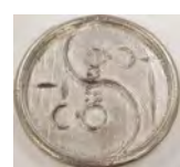
Sun and Moon Hazel Song