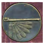
Peace Pipe George Cuhaj