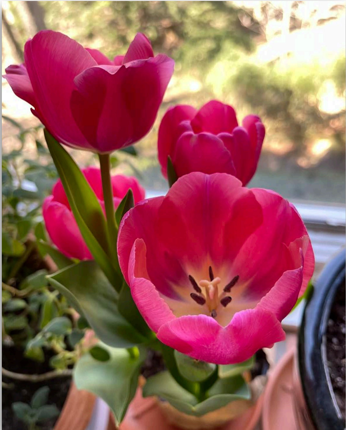
Tulips are opening!