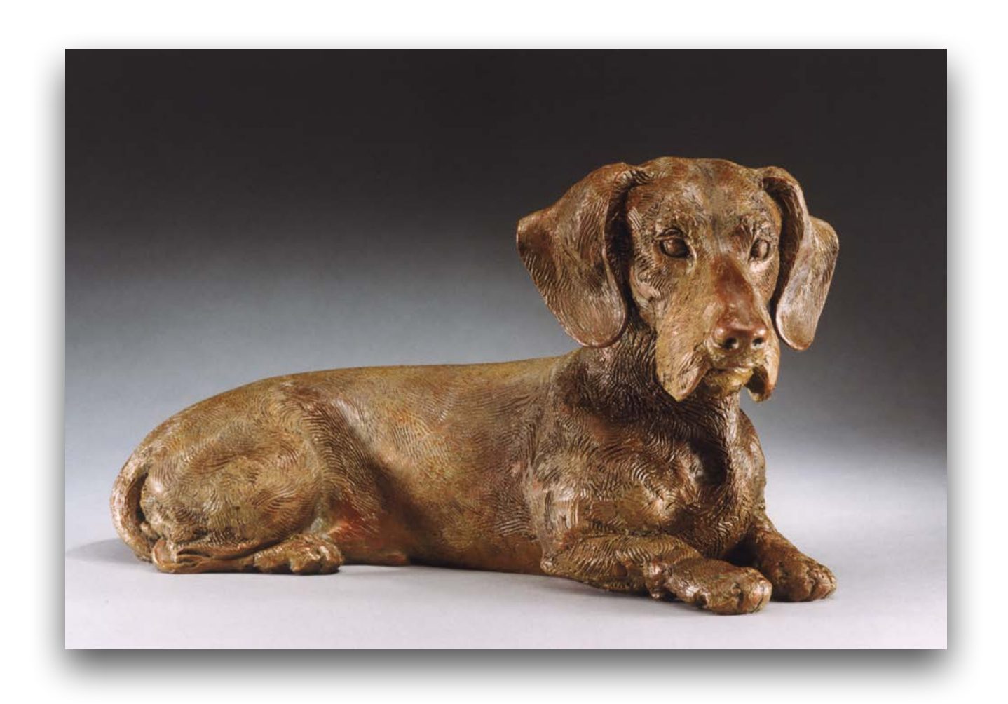
"Lord of the couch" MW

June 20. 2023: The Straz Center, Tampa, FL, extends the display of "Lord of the Couch" MW, for one more year.