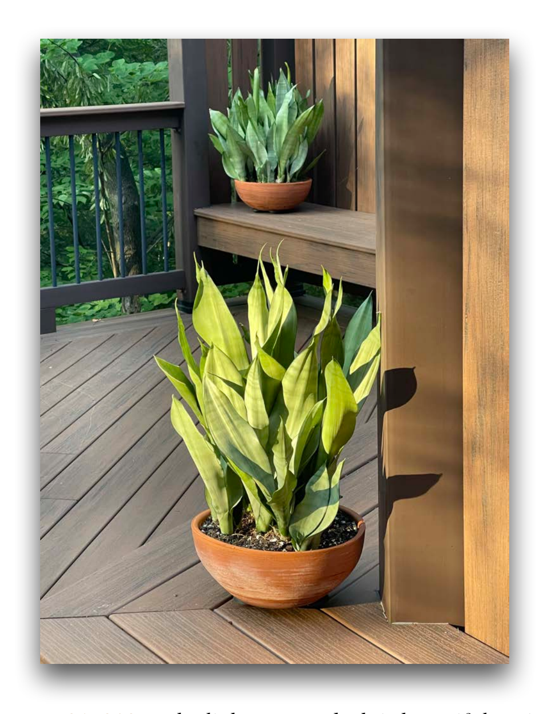
June 21, 2023: The light on our deck is beautiful tonight.

Our air quality has improved tremendously over the last week or two when Canadian wildfires spewed smoke and dust especially over the east coast. We just had very gray skies and warnings to stay inside.