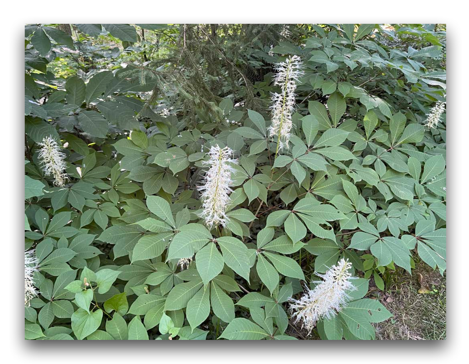
Bottle Brush Buckeye

wildfires burning in Canada. We are predicted to have 100+ degree temps for the next two days.