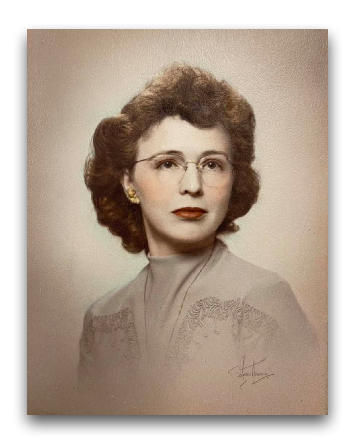
Happy Mother's Day, mom! This picture was taken well before I was born. I remember this blouse.