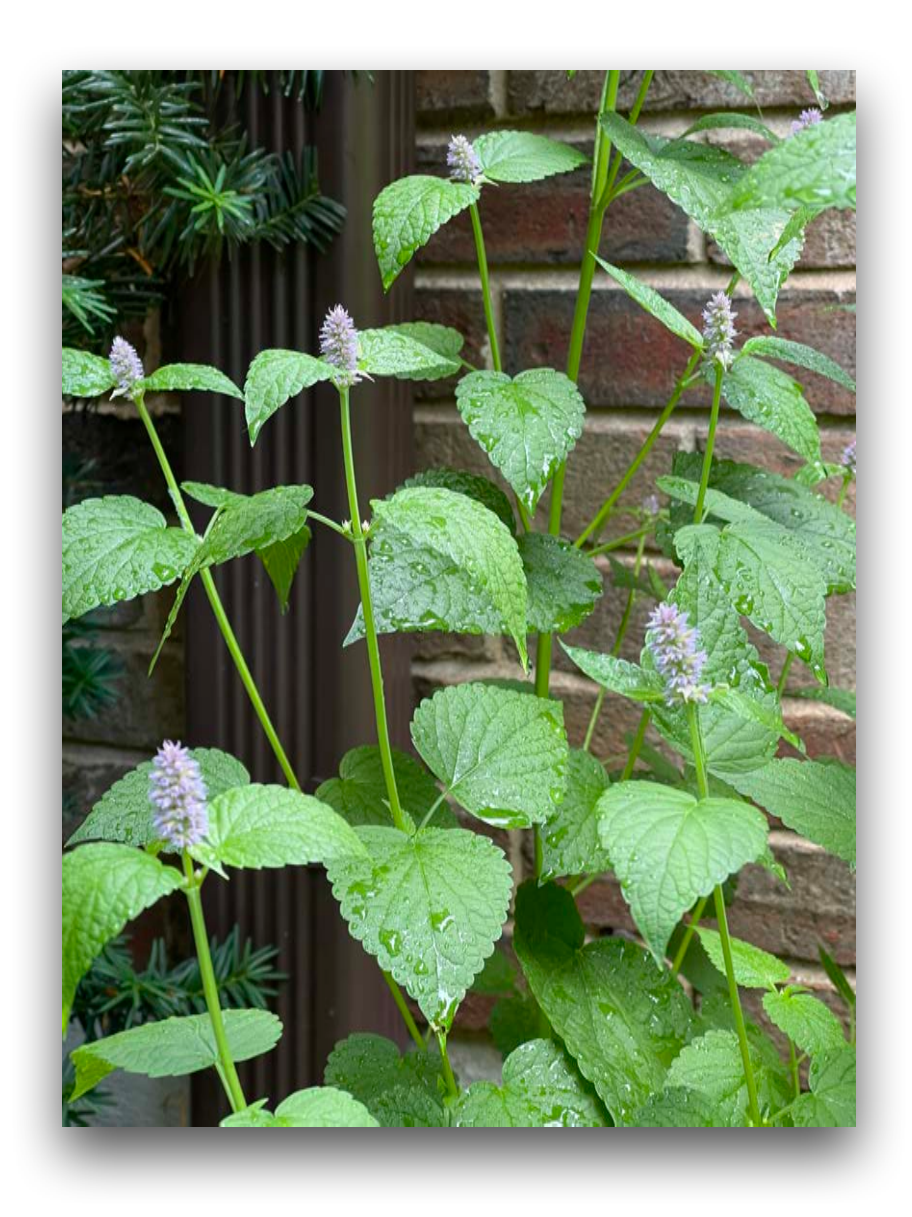
Blue Giant Hysopp

This beautiful, pollinator friendly plant, enjoys our brief rain.