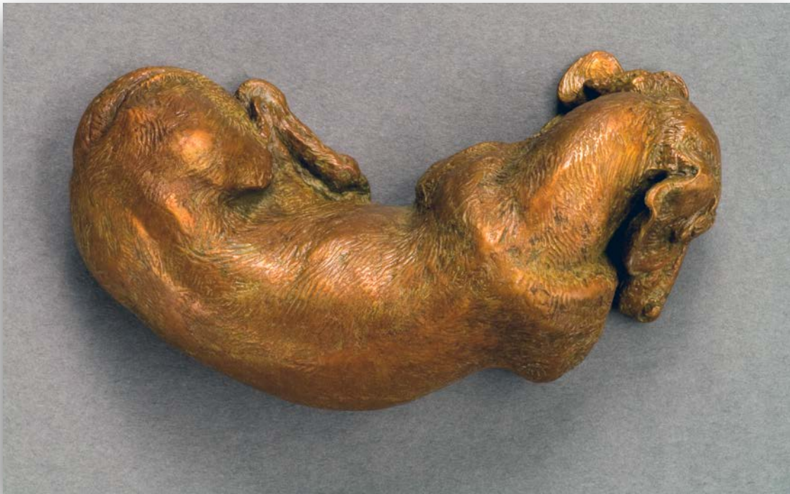
“Siesta” Smooth, 1:6 Scale