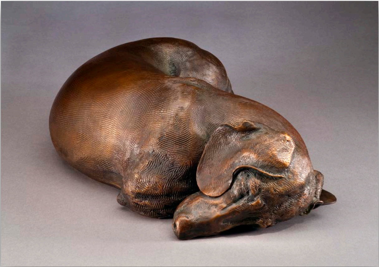
"Siesta" MS Life-size Miniature Smooth