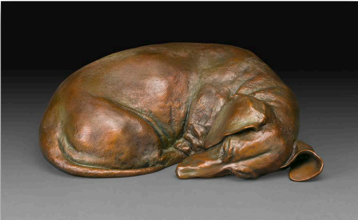
"Dreaming of Tomatoes, Too" MS

14.5"W x 5"H x 9.25"D, Bronze, Edition 9 & 1 AP, (c)2021