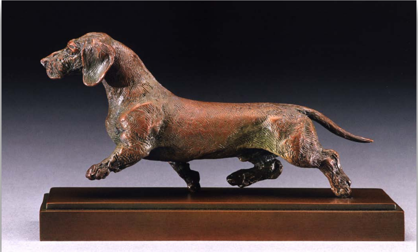
"Dream Chaser" Wire 1:6 Scale

WOW! All of the above bronzes sold at DCA!