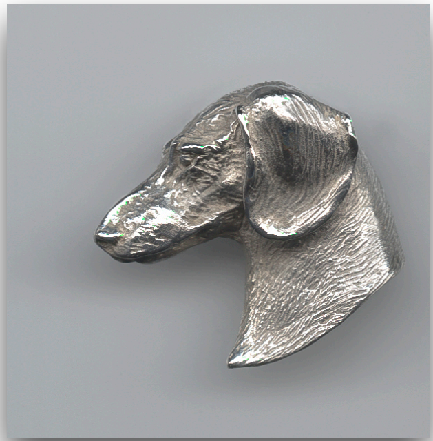
"Dear to my Heart" Smooth, sterling silver