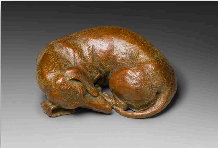
"Sweet Dreams II" 1:6 scale