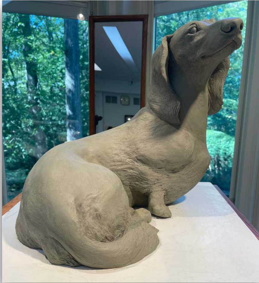
"So Good to See You, Too"