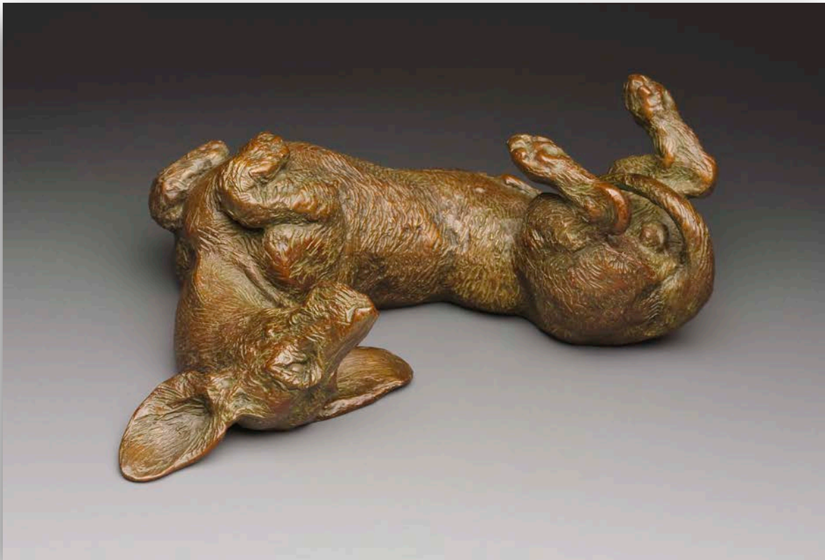
"Sunnyside up" Wire 1:6 Scale