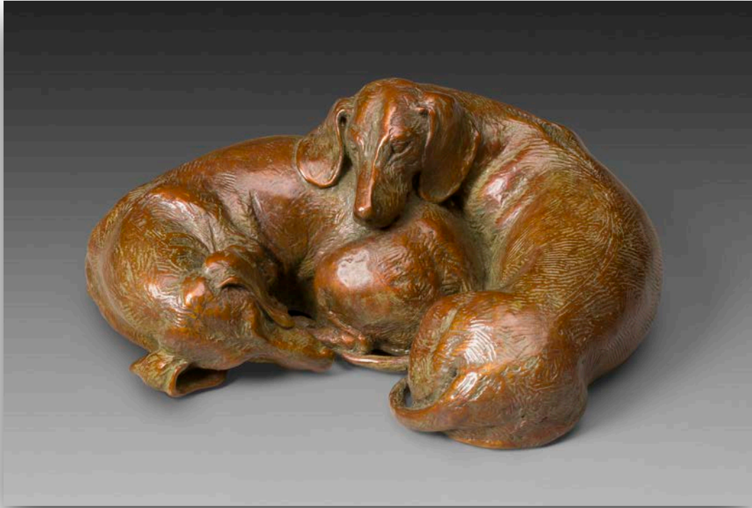
"Cozy" Smooth 1:6 scale