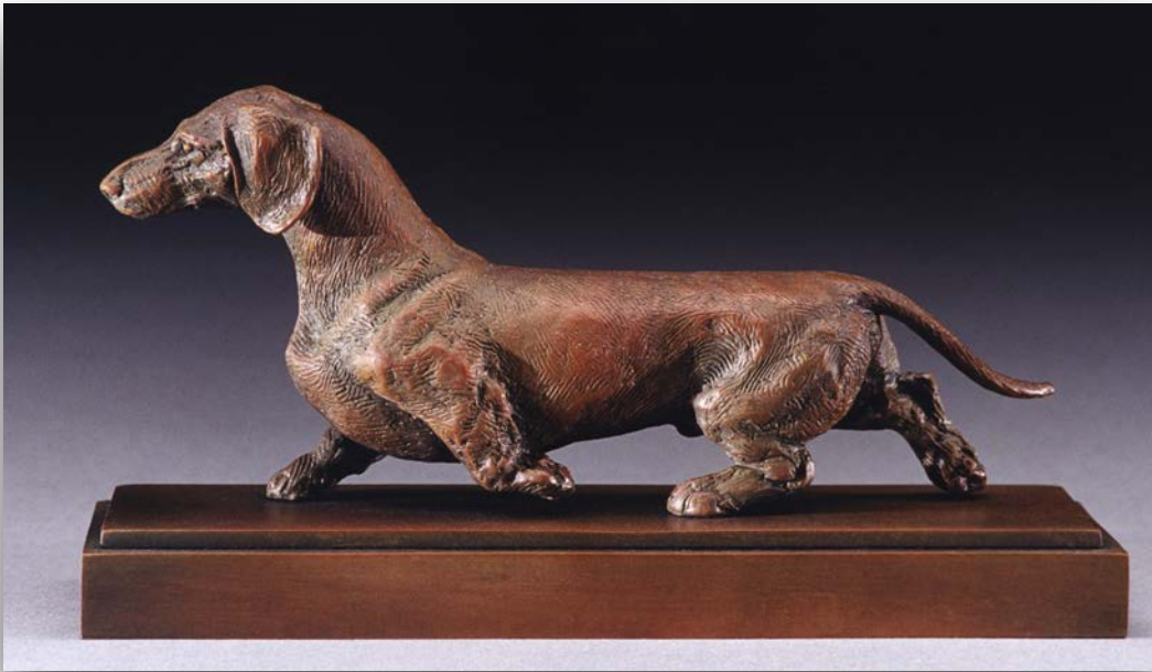
"Dream Chaser" Smooth 1:6 scale