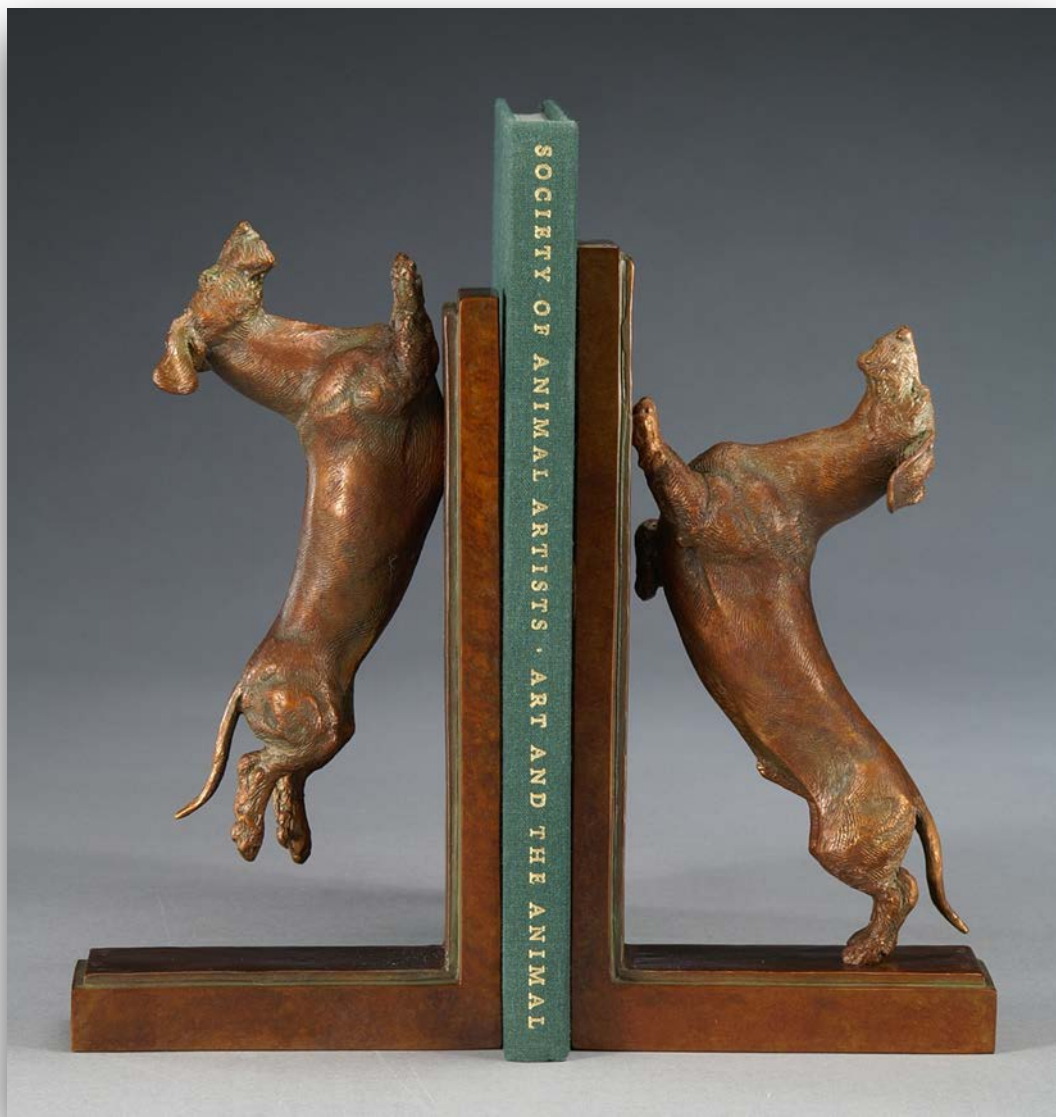
"Squirrel season" Wire 1:6 Scale

4:55pm : A tornado warning is issued for home. It is DARK and raining! EIGHT tornados hover across the St. Louis area. All is well; NO TORNADOS touch ground!