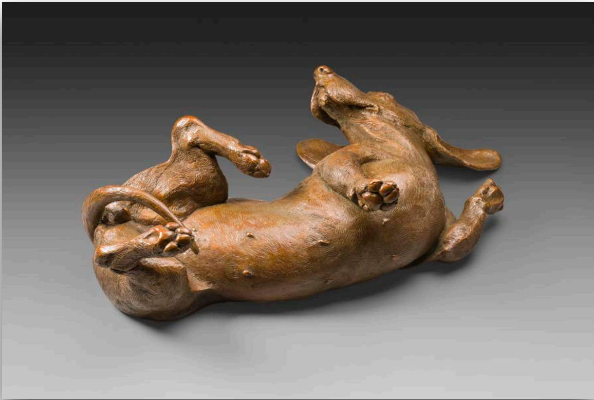
"A Good Life" MW Life-size Miniature Wire