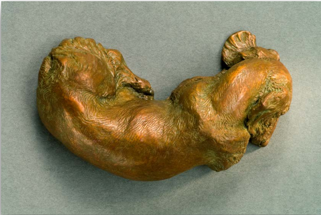
"Siesta" Long 1:6 Scale