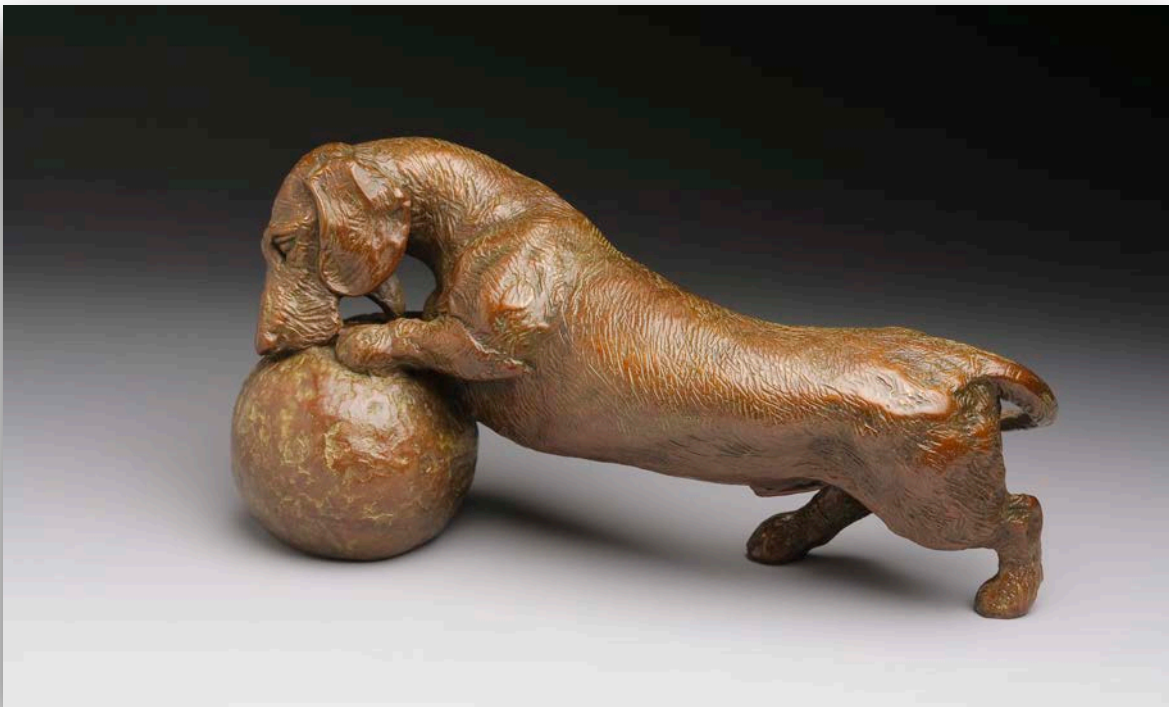
"Life's a Ball!" Wire 1:6 Scale