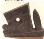
Balancing I Mashiko