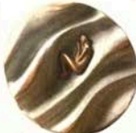
Sleeping in the Waves Lindley Briggs