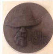
Noir Eva Wohn