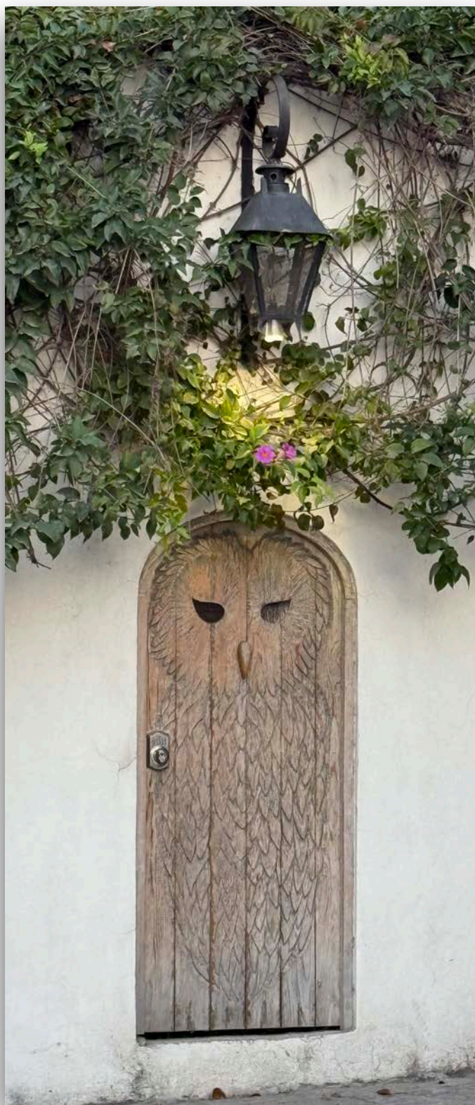
My favorite hand carved doorway at the end of our block.