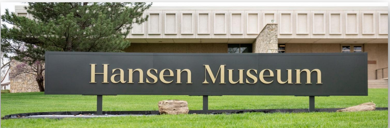
The ANIMAL GROUPS exhibition closes at the Dane G. Hansen Museum in Logan, Kansas.