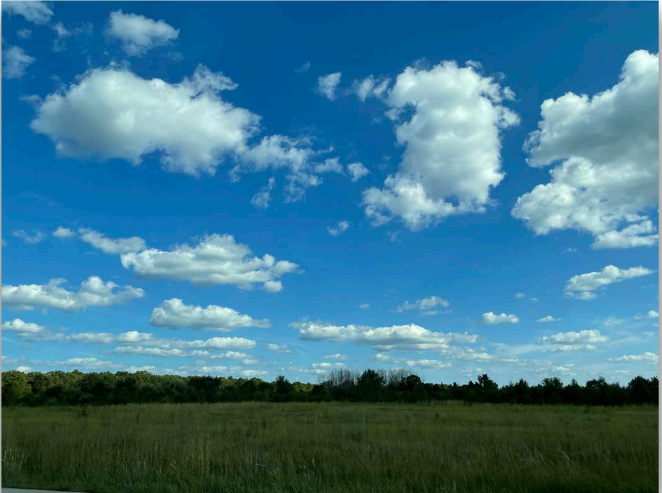
A beautiful day in Cuba, MO.