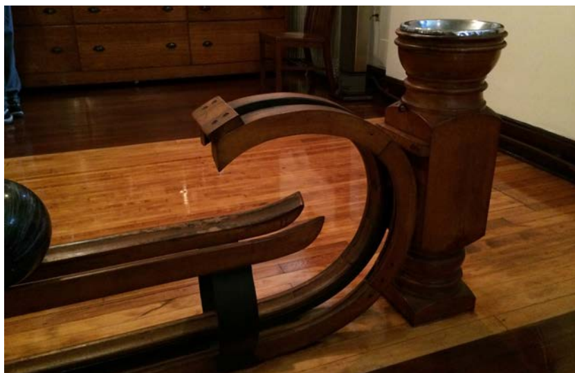
Curved lines grace the bowling alley. A ball is to the left.