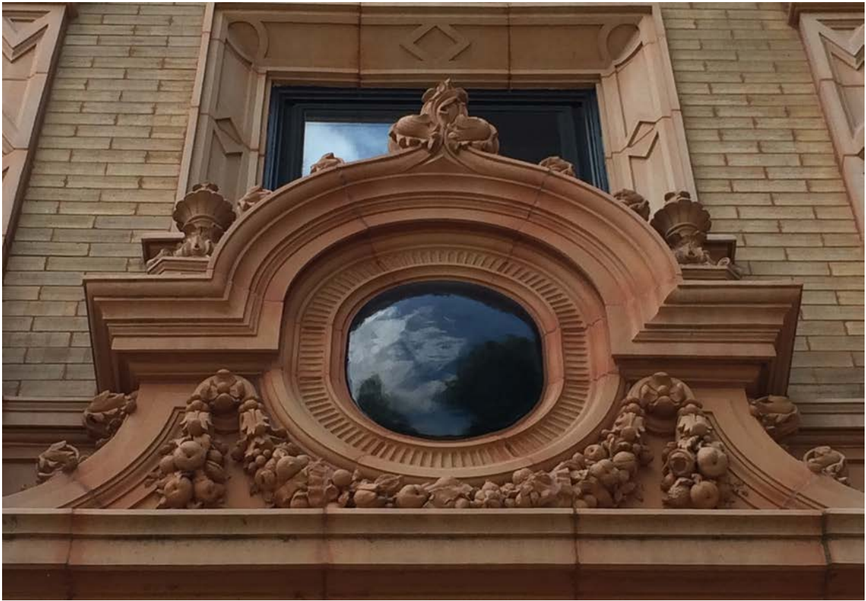
Do you see the face in the clouds in this window above the front door?