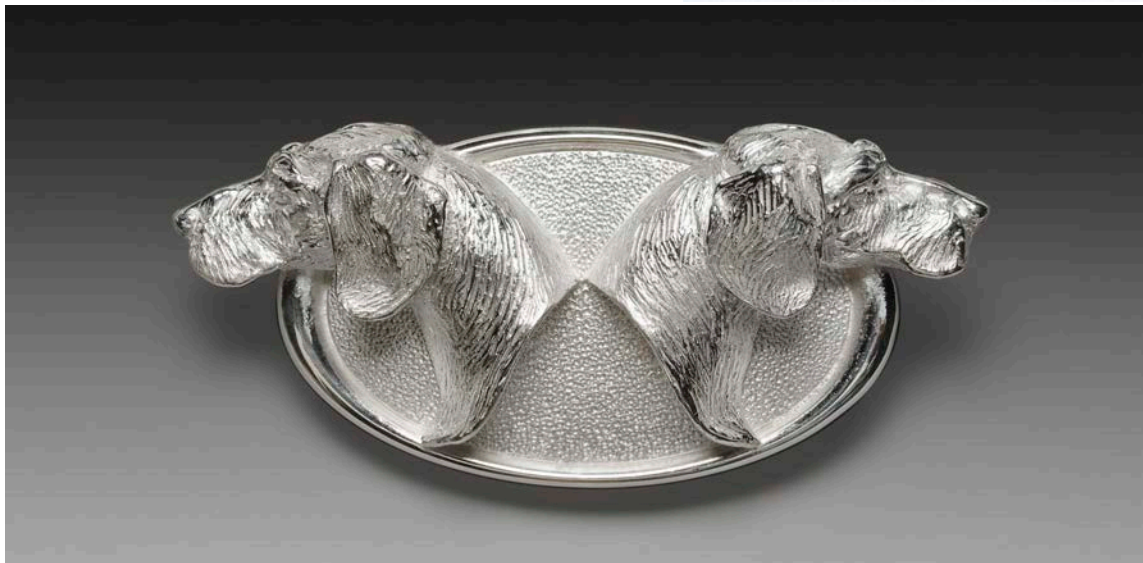
Freshly cast and freshly photographed "Coming & Going" Wire Buckle ©2001 Photo: Don Casper