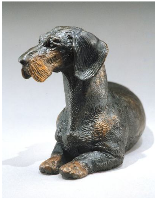
"Lord of the Couch" Wire, 1:6 Scale ©2003 Shown in Wild Boar patina

SEPT. 20, 2016 : Yay! "Lord of the Couch" Wire, 1:6 Scale, and "Coming & Going" Wirehaired sterling belt buckle are in the hands of UPS and on their way to California for a Christmas gift! Thank you, Sharon, for thinking ahead!