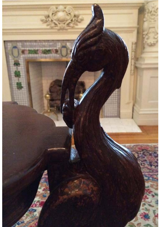
A pair of wooden carved cranes flanks both sides of a small table in the formal French living room.