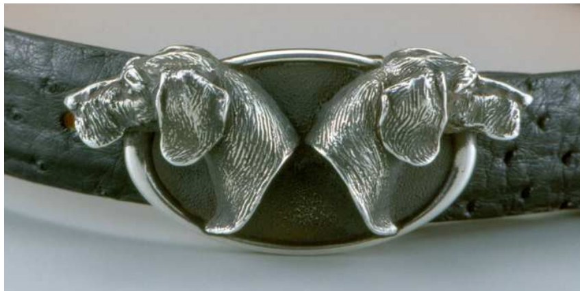
Over time, Mother Nature will give your "Coming & Going" sterling buckle a glowing patina.