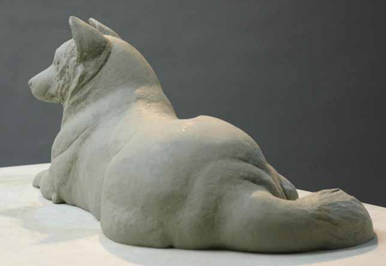
"Gentle Cloud" Clay for Bronze. Approximately 22½" L

This year I completed two commissions: a Bouvier des Flandres pendant and a half-life Akita with a cloud-like 3-4" long, hard, dense, double coat. Each was a hairy challenge!