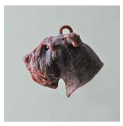
"Dear to my Heart, One" Bouvier des Flandres Pendant Wax for Sterling