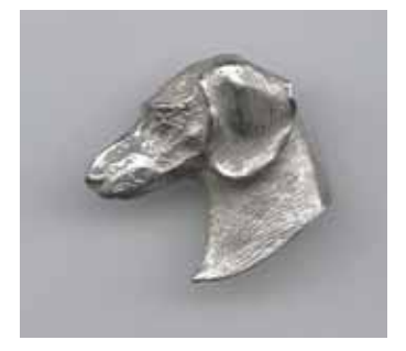
"Dear to my Heart-Smooth, Three" Sterling Slide

TIP from the jeweler who casts my work: Simply use baking soda and water to restore sheen to your fine jewelry: just wet your fingers, dip in baking soda, and gently rub over the piece until the desired sheen appears!