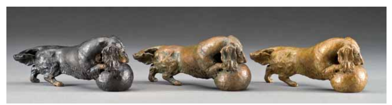
"Life's a Ball Long" 1:6 scale. Bronze shown in three patinas.

You are invited to see, touch and be touched by my work at these events!