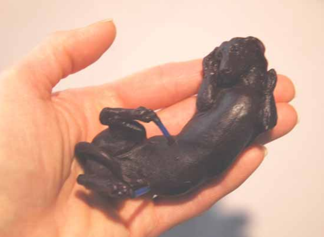
"Sweet Roll" Wax for Bronze. The original 1:6 scale wax in my hand.

If you long for a certain piece of my work, may I suggest that you acquire what has already been cast, as new casts may be more expensive due to rising metal costs. Now is a great time to reserve your piece for a special occasions. IF your piece must be cast for you, I must order and chase a wax for you <u>now</u> for pre-Christmas delivery. My newly completed CLAY TO BRONZE explains the process in detail. To learn about this labor intensive process, please click here: http://www.joybeckner.com/clay-to-bronze/clayto-bronze-sculpture.html