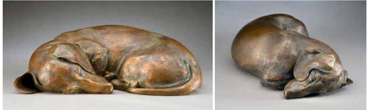
"Dreaming of Tomatoes, MS"