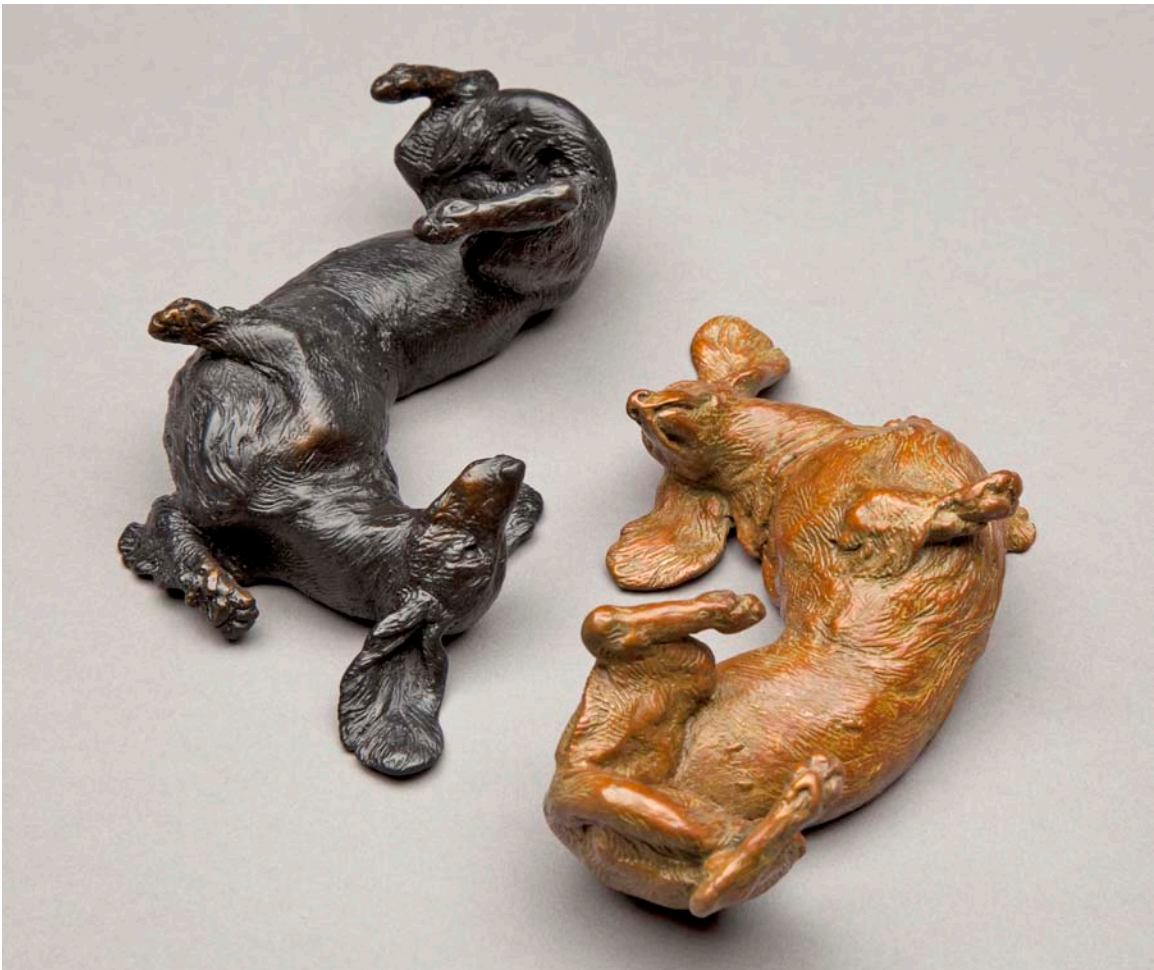
"A Good Life" Long 1:6 Scale, Approx. 5"L, Bronze, Edition: 50 & 5 Artist's Proofs ©2011