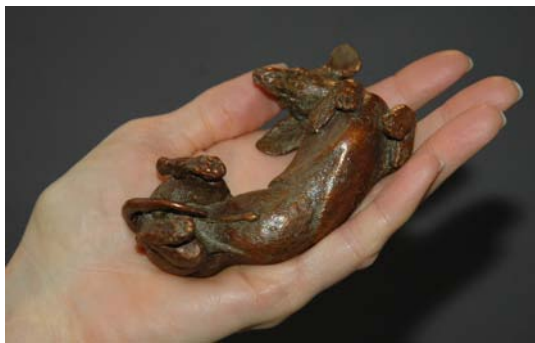
Sunnyside Up , #21/99