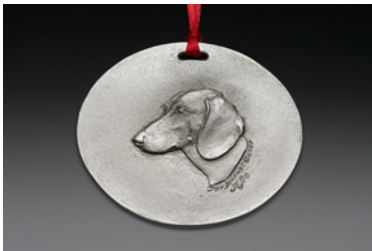
"Inspiration" 3 3/8" x 2 3/4" x 1/4" PEWTER, EDITION OPEN, ©2009 Sculpture Photography by Mel Schockner and Don Casper :: Bo Duke Photography by Joy

636-532-3216 :: INFO@JOYBECKNER.COM :: WWW.JOYBECKNER.COM JOY KROEGER BECKNER, 15268 KINGSMAN CIRCLE, CHESTERFIELD, MO 63017-7412