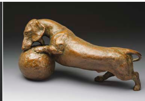
Life's a Ball! #97/99.

Please watch for these numbers and, once again, please be aware of what you find on the Internet; these pieces may well be on their way to the Far East to be knocked off! What happened to the Golden Rule???