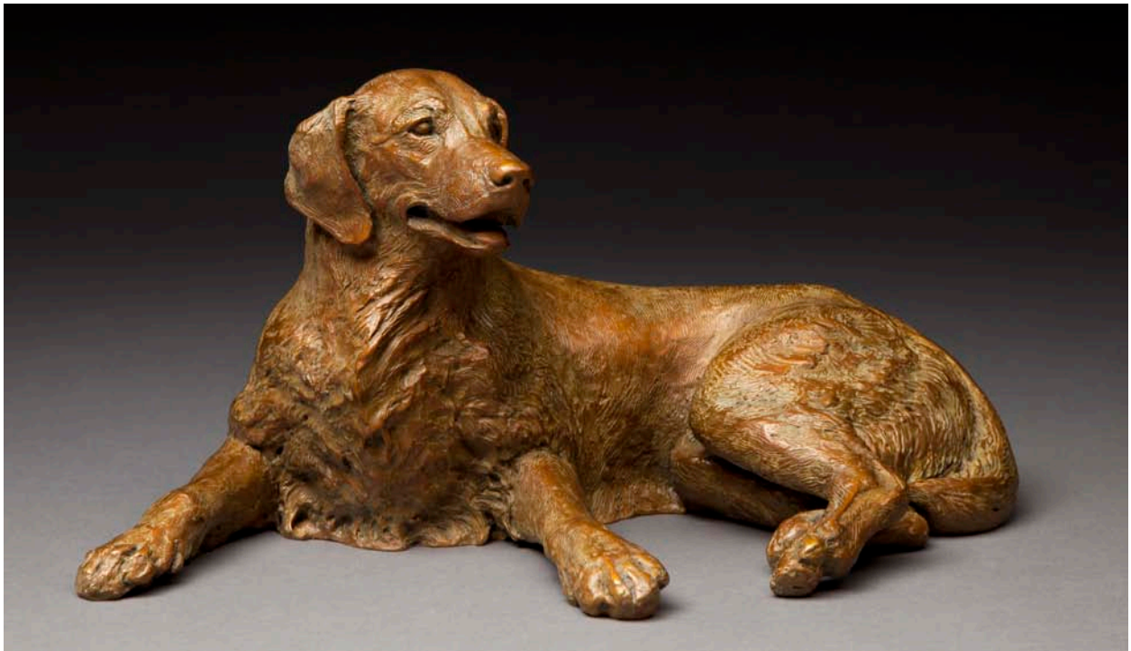
"Merry Sunshine" 1:4 Scale, 10 1/2"L x 7"D x 5"H, Bronze, Edition: 50 & 5 Artist's Proofs ©2011

"Merry Sunshine" debuted at the American Women Artists show, at Huff Harrington Fine Art, Atlanta. See it there through November 3.