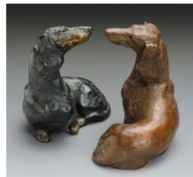
"So Good to See You" Long ©2009