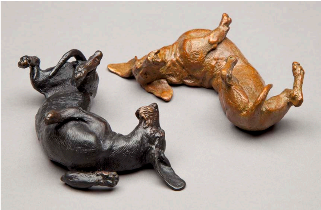
"A Good Life" Wire 1:6 Scale, Approx. 5"L, Bronze, Edition: 50 & 5 Artist's Proofs ©2011