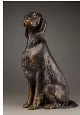
"Big Heart" ©2009

NOVEMBER 3 – JANUARY 6, 2012 , The Council for the Arts, 27th Annual Exhibition 'Miniature Art 2011'. "So Good to See You" Long, 1:6 scale, (A pair is pictured to the right.) earned a Merit Award! See the show at 159 S. Main Street, Chambersburg, PA 17201