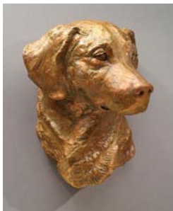
"Over the Rainbow" ©2005

SEPTEMBER 26, 2011 – JUNE 2013 , "Performance in Sculpture" exhibition at the David A. Straz, Jr. Center for the Performing Arts, 1010 Macinnes Pl., Tampa, FL.