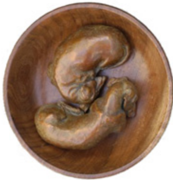
"Siesta" & "Dreaming of Tomatoes" 1:6 Scale

May 19, 2021 : My web master is completely updating my site. He last updated it in 2013. He said it is 300 pages to update in several months. What a JOB!