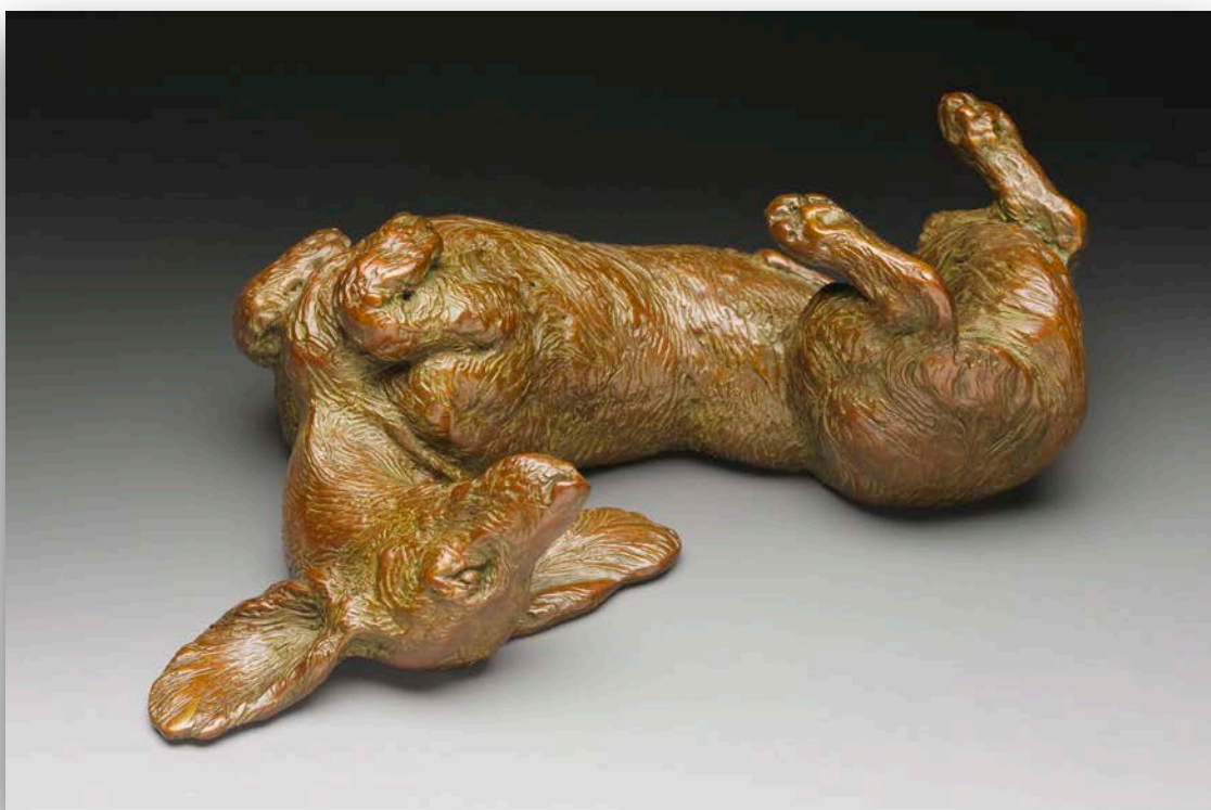
"Sunnyside up" Long, 1:6 Scale