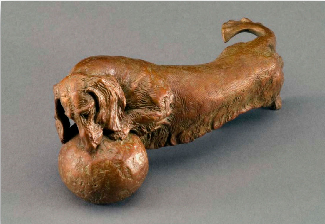
"Life's a Ball!" Long, 1:6 Scale

March 24, 2021 : My three 1:6 Scale bronzes arrive at the Red River Valley Museum for their May-July show: " Life's a Ball! " Long, " Sunnyside Up " Long and " Cozy " Smooth.