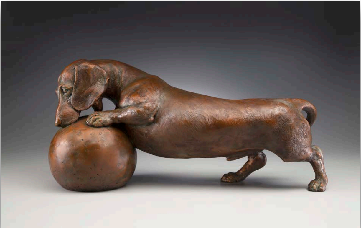
"Life's a Ball!" MS

I pick up " Merry Sunshine " half life-size, and will drive it and " So Good to See You, Too " to my Loveland, Colorado, mold maker. Dan, my trusted Colorado mold maker, estimates a urethane mold will cost around $300 each, plus $80 for each wax. Two molds; maybe $350 each, = $700, plus $320 for the four waxes. Total: $1020. Hey! $3800 local plus overnight for four waxes: $400 if I'm lucky = $4200. I know I can do this for less. $3800 - $1020 = $2780 saved. Urethane will last as long as I need it to last!