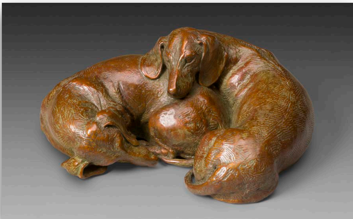
"Cozy" Smooth, 1:6 Scale