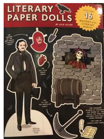
Edgar Allen Poe

Books of Paper Dolls may be purchased in the extensive Cheese Importers Gift Shop.