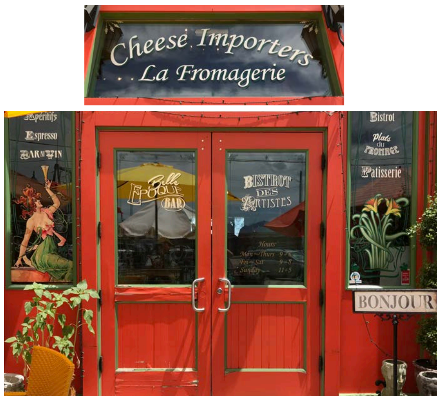
Doors from the Patio to inside.

JUNE 8, 2018: Today is a very special treat! Karryl Salit drives us to Cheese Importers, “Where Food is Art!”. Located at 103 Main St., Longmont, CO, it is a very French “Gourmet Warehouse, European Marketplace & Bistro”. A Colorado Family Owned and Operated Company for over 30 Years, the Website is www.cheeseimporters.com . We sit at a tiny orange umbrella covered table on the Patio and each order the Mediterranean and a Café Au Lait. Yummy!