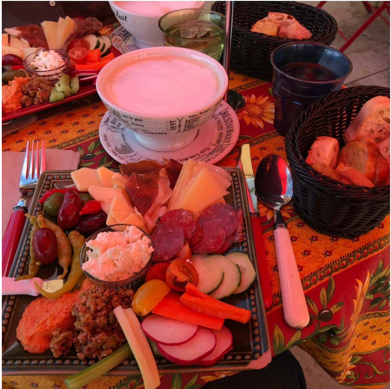
The Mediterranean and a Café au Lait. It's enough for lunch and dinner!