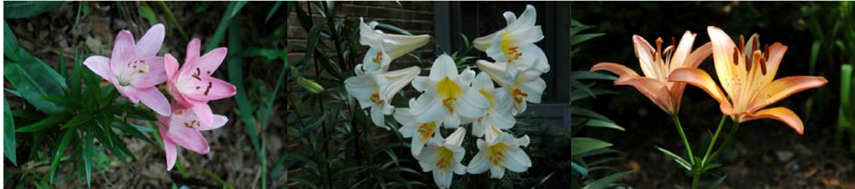
Lilies in my June Garden: Dream Catcher, Regale, Royal Sunset

NEWS OF JOY :: VOLUME FIVE, NUMBER THREE :: JULY 2009