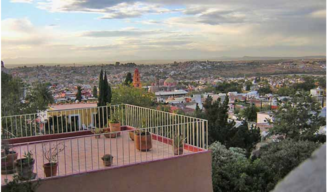
Overlooking San Miguel de Allende from the roof of our rental apartment at Calvario 8.