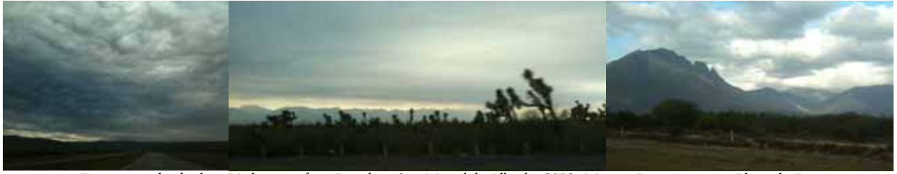
Fascinating clouds along Highway 85 from Laredo to San Miguel de Allende, GTO, Mexico, January 1, 2012.