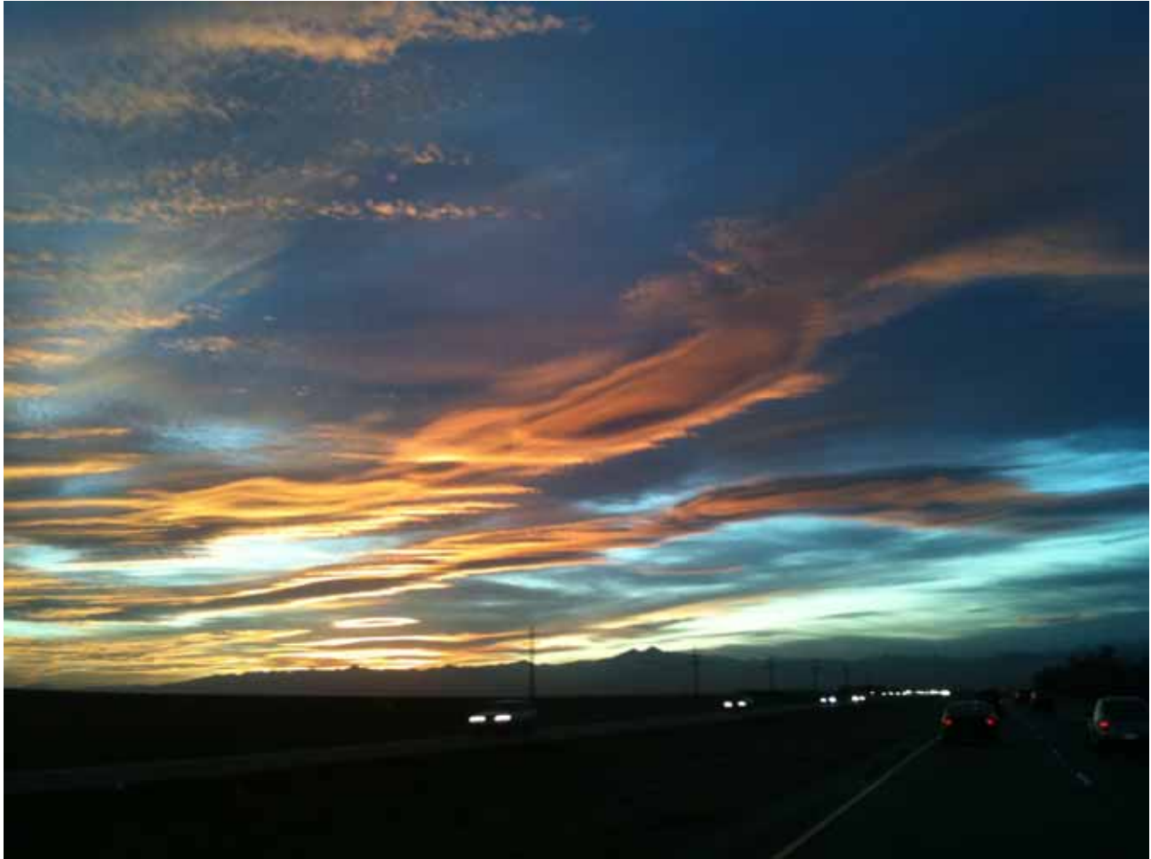
Colorado Sunset, near Grand Junction, CO, Thanksgiving Eve, 2011.

May you enjoy a healthy, happy and prosperous year.