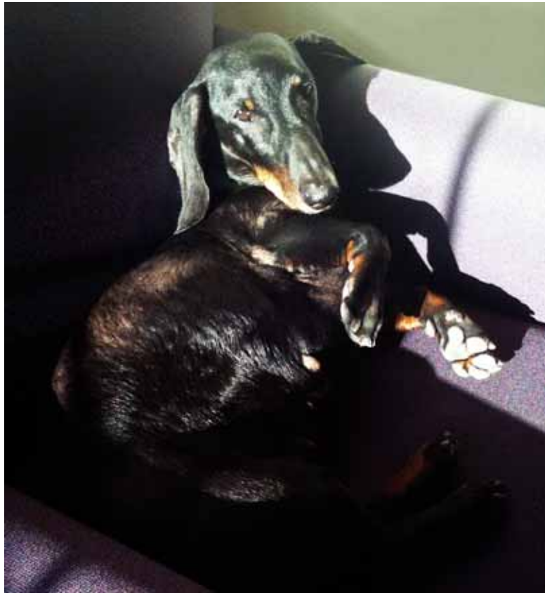
Late November 2011, at the La Quinta, Loveland, CO.