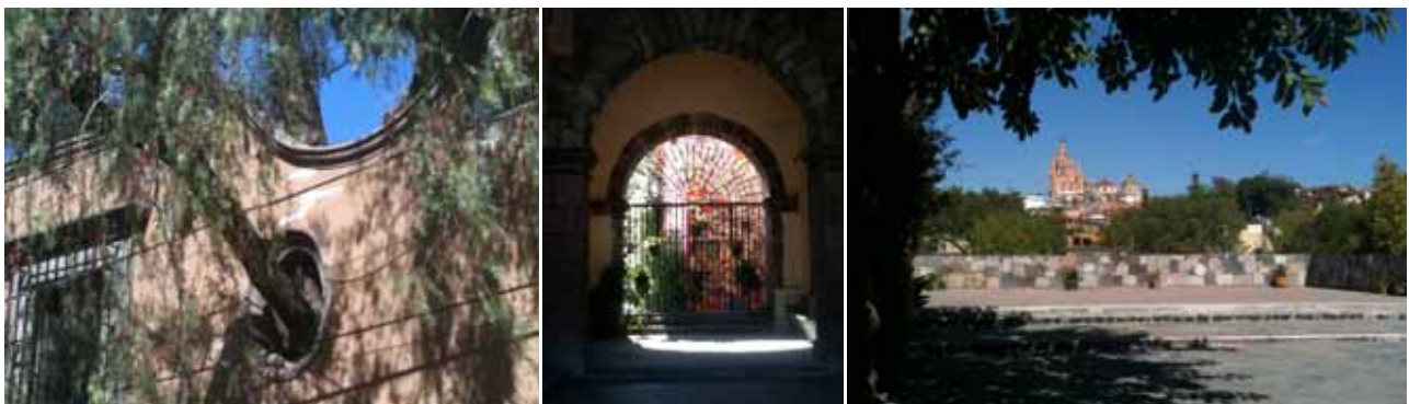
In and near the Instituto, January 8, 2012.

JANUARY 8, 2012, WOW! What a difference a week makes! Today is sunny, warm, and absolutely beautiful!