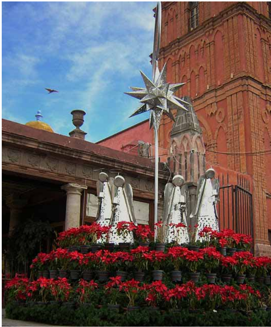
JANUARY 14, 2012 , Brian is all set to take a picture of this very narrow street when a beer deliveryman carrying three cases of beer on his back walks up the hill toward the car. See him enter the building on the left. Below is a large Christmas display in the Jardin, where locals and foreigners gather.