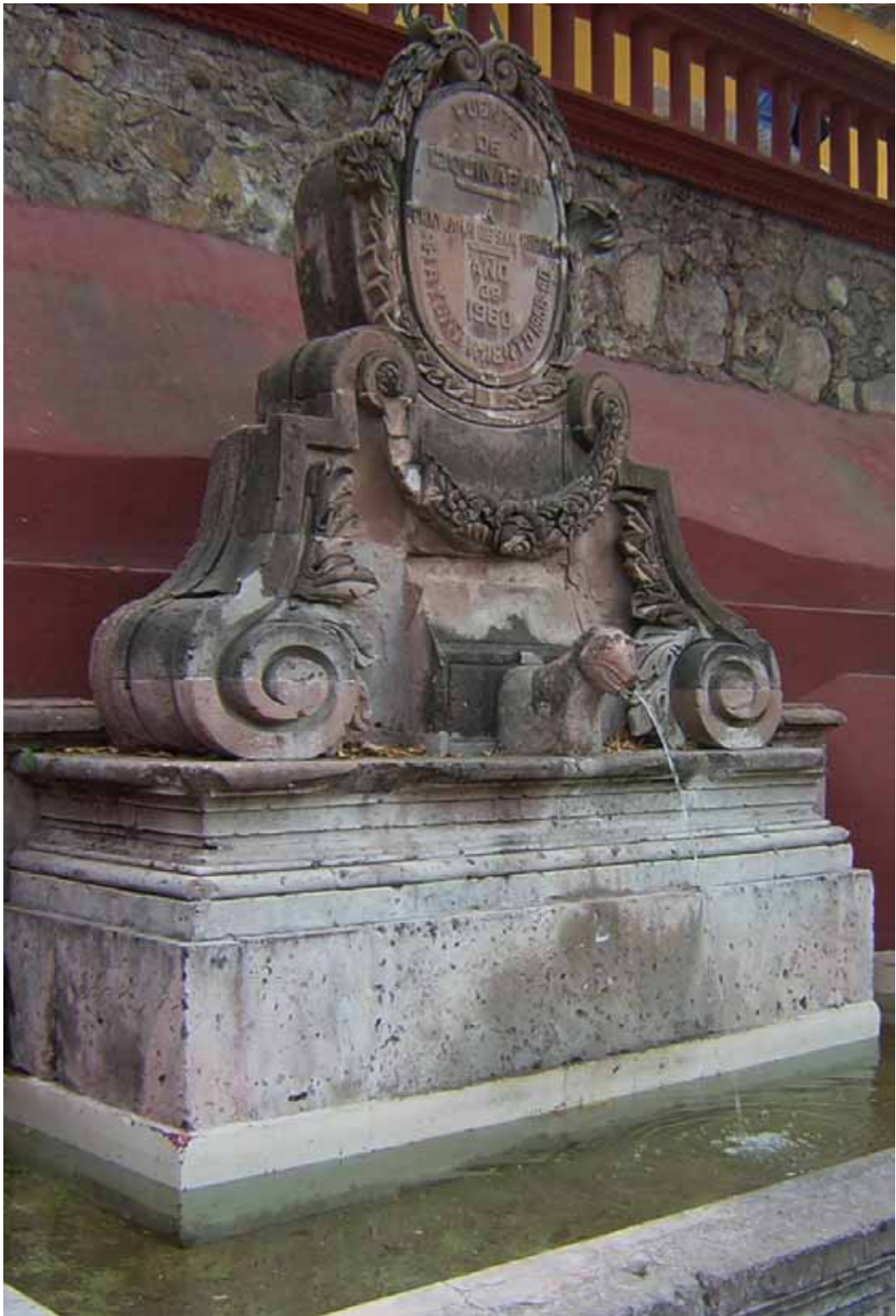
The El Chorro fountain below the mission was installed in 1960. Check the short dog with the long broken nose!