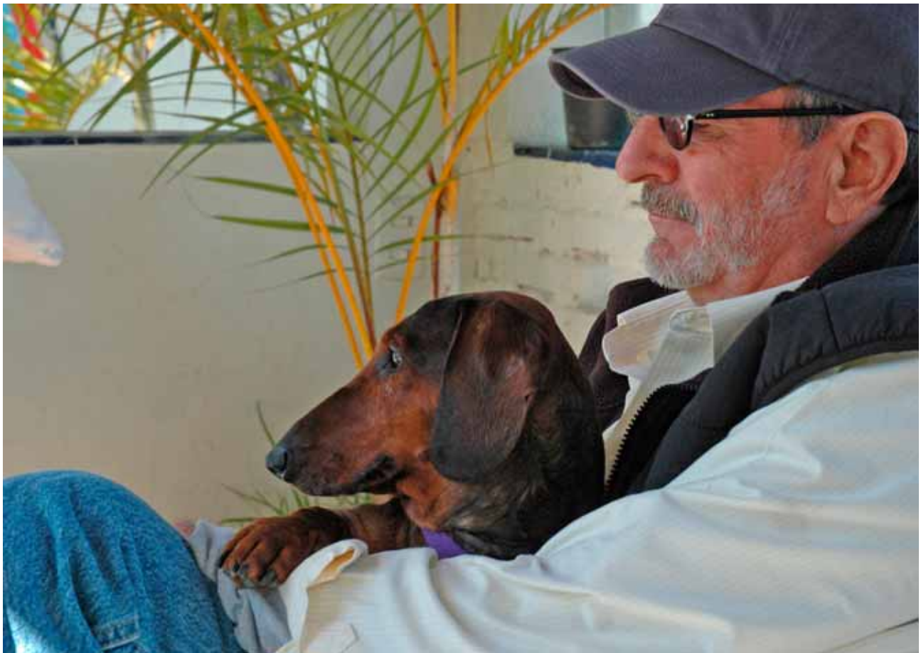
Sophie's new beau, the bodacious Bo Duke! January 11, 2012, on the terrace above the apartment that we rent in San Miguel de Allende.

JUNE 2012 , Bodacious Bo Duke enters our lives. The handsome, Ch. Turning Point What Was I Thinking , (DOB, March 7, 2006) is a real lover. Sophie adores him, licks him and acts as though she is still two years old around him. Read into that what you wish. She definitely is Queen Bee!