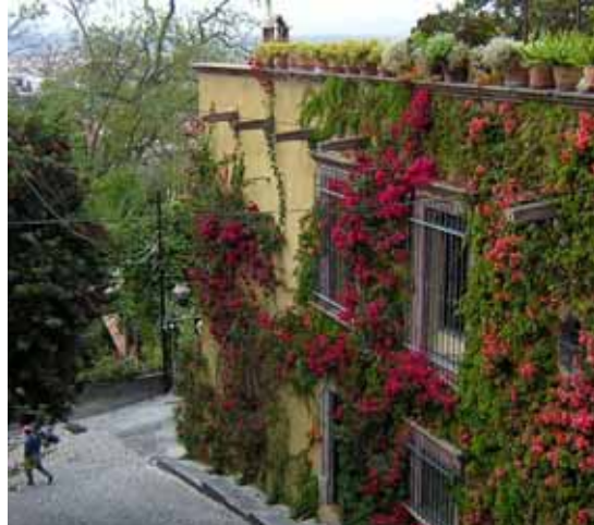
Top: Lavenderia below El Chorro, Looking down from El Chorro. Bugambilia covered home below El Chorro