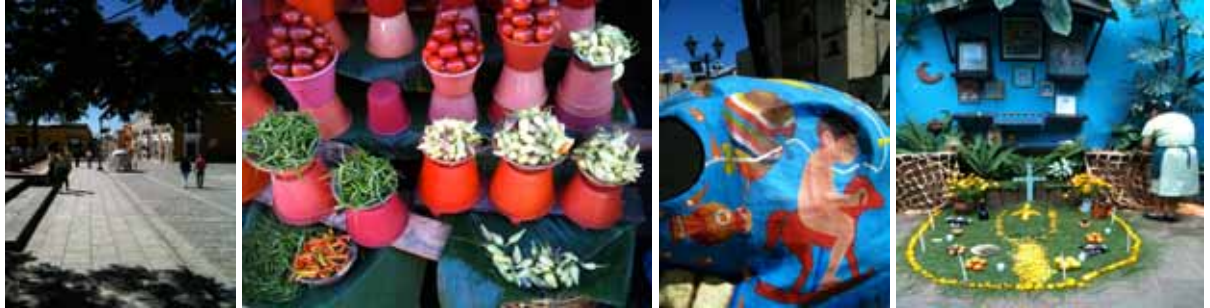
Oaxaca: Looking toward the Zocolo from Hotel Casa Conzatti; Peppers in the Mercado, San Christobal de Las Casas; Oaxaca, Day of the Dead: Art scull and, an altar featuring favorite things an honored person enjoyed during his or her lifetime.

Although the BMW agenda for Sunday, October 31, called for a 300 mile "side" trip to see the huge Mayan ruins at Palenque, based on our experience of driving 300 miles in twelve hours two days before, we opted to return to Oaxaca a day sooner than "the agenda." After all, it would take another twelve hours and we gals had booked flights home on Tuesday, Nov. 2 We wanted to be in Oaxaca, Nov. 1, for Day of the Dead. If you take this trip, budget more time !