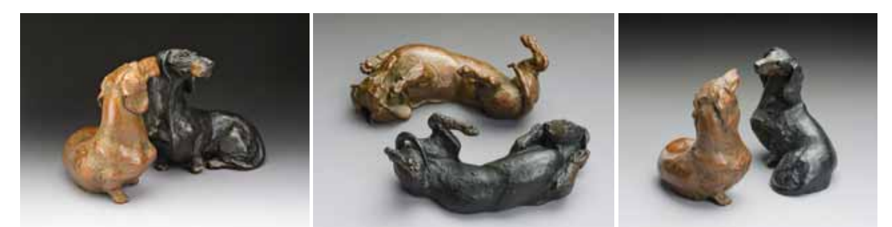
The above 1:6 scale pieces are shown in both patinas. Left to right: "So Good to See You" Wire; "Sweet Roll" Smooth; "So Good to See You" Long.

Would you like for me to reserve a piece for you? Many are available. Please ask. Please email me to reserve yours for the earliest possible delivery.