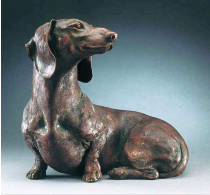
So Good to See You" SS

The blue foam enlargement of the quarter-life "Merry Sunshine" has arrived. Once I complete my computer updates, in January, I will add clay and start to detail this sculpture for completion in bronze in early summer. Please place your order now. "Merry Sunshine" half-life size, will be an edition of 9 & 1 Artist's Proof. Copyright 2011, Created in 2021. Please order now for delivery in Summer 2021.