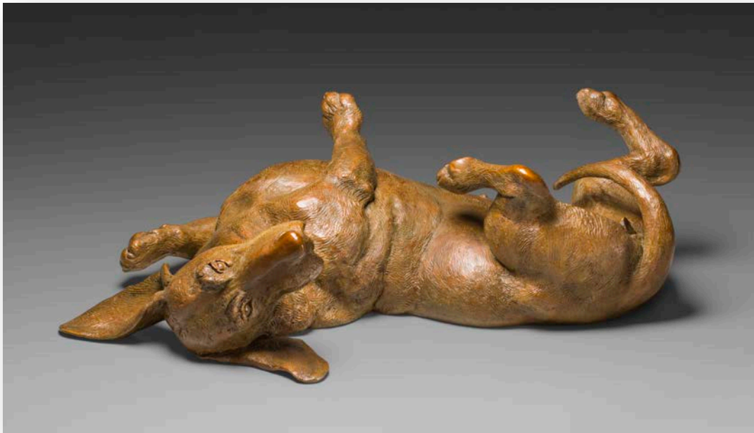
"A Good Life" Miniature Wire

YAY!!! "The Art Renewal Center is pleased to announce that we have posted our roster of finalists competing in the 15th International ARC Salon Competition. We received 4,941 entries this year from 83 countries. 40%, 1,977 works, were selected as semi-finalists, all of which will be featured on the ARC website. And although it has been very difficult to make additional cuts for the 15th ARC Salon hard bound book, International Realism, 1,155 works have now been selected as our finalists, 23% of entries. "