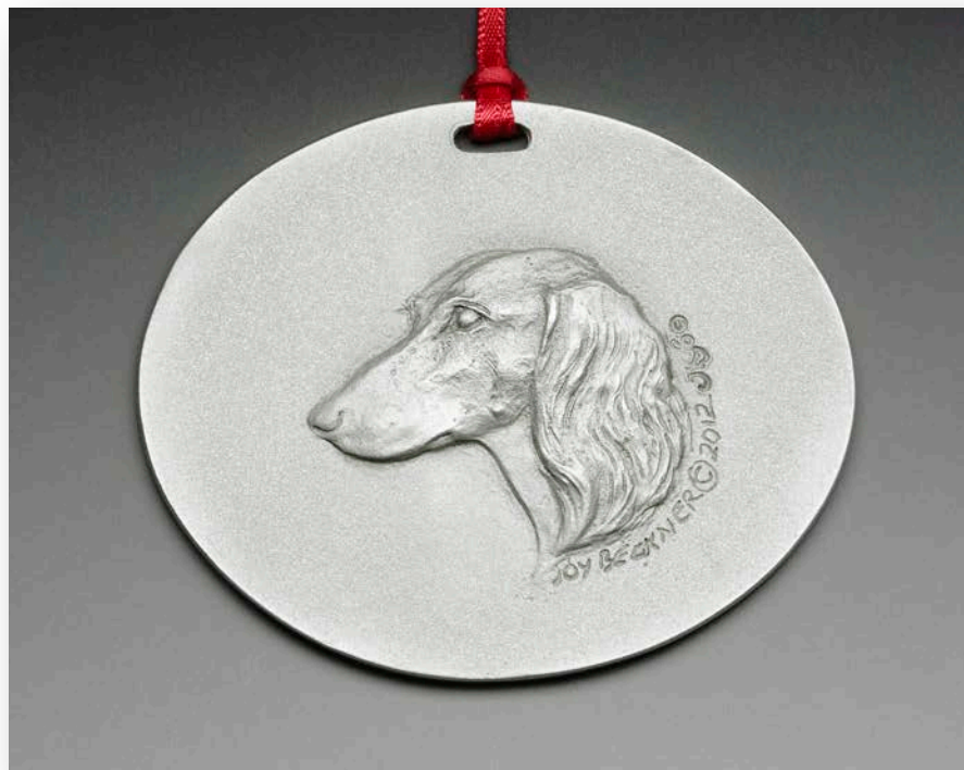
"Inspiration" Smooth, Wire or Long 3 3/8" x 2 3/4" x 1/4" PEWTER ED: OPEN, w/RED OR BLUE RIBBON (C) 2012