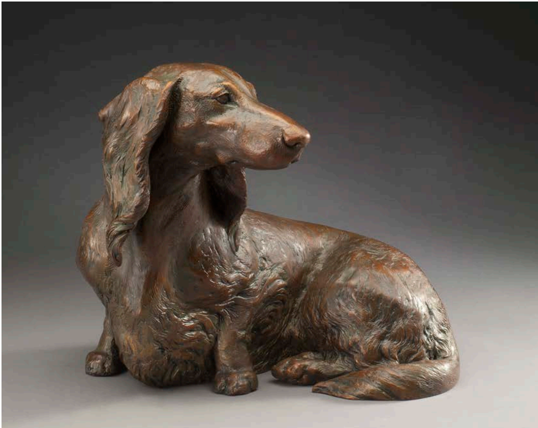
"So Good to See You" ML 14 1/2"L x 12"H x 12"D BRONZE ED. 10 & 1AP ©2011 The final two casts of "So Good to Se You" Long are available for adoption.