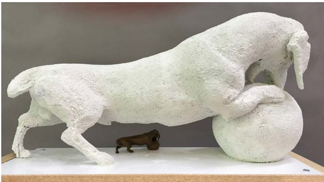
"Life's a Ball" MS, painted. Ready for clay.