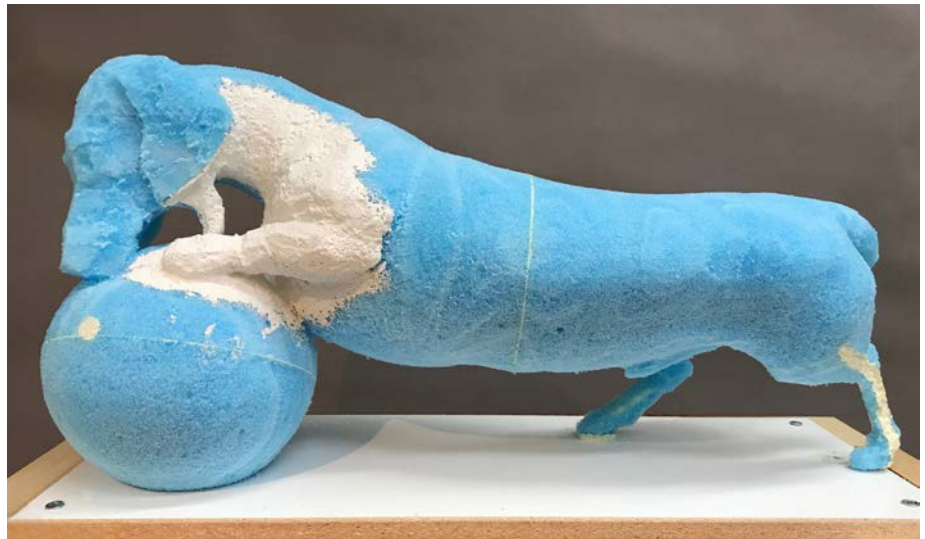
Raw Foam Detailed and Partially Painted