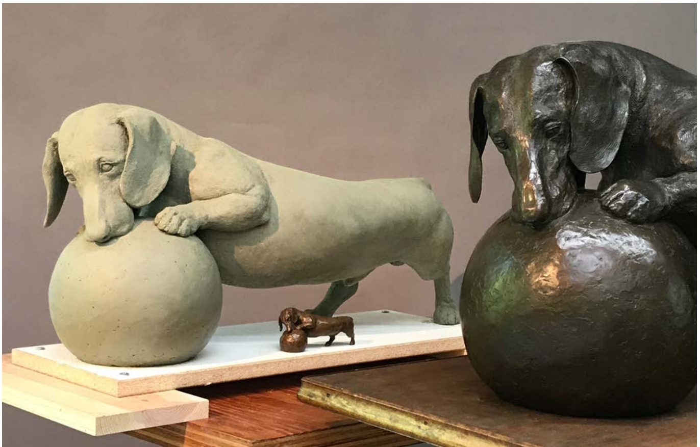
And, surprise of surprises, a female 1:6 Scale miniature version, "Her Life's a Ball!" will debut in December!