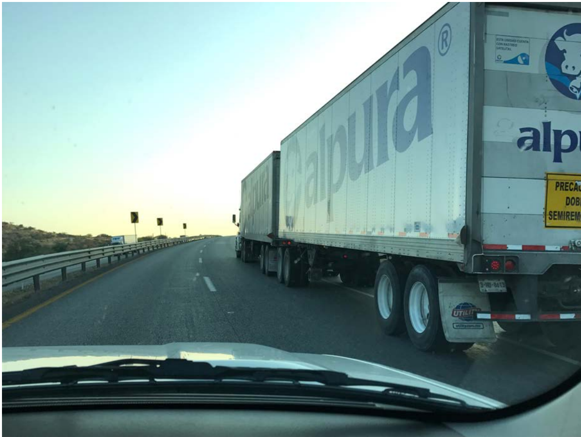
A doble remolque carries dairy products.

11:58pm: We have adventures in driving: a doble remolque (double 18-wheeler) loaded with rock, concrete or something VERY heavy crawls uphill in the right lane. It follows a single 18-wheeler loaded the same way.