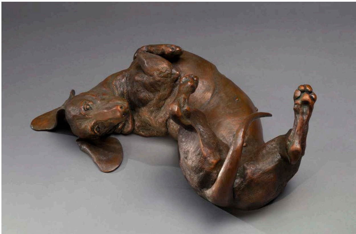
"Miss Me" MS 19.5"L x 11"D x 7"H BRONZE ED. 20 & 2AP ©2015