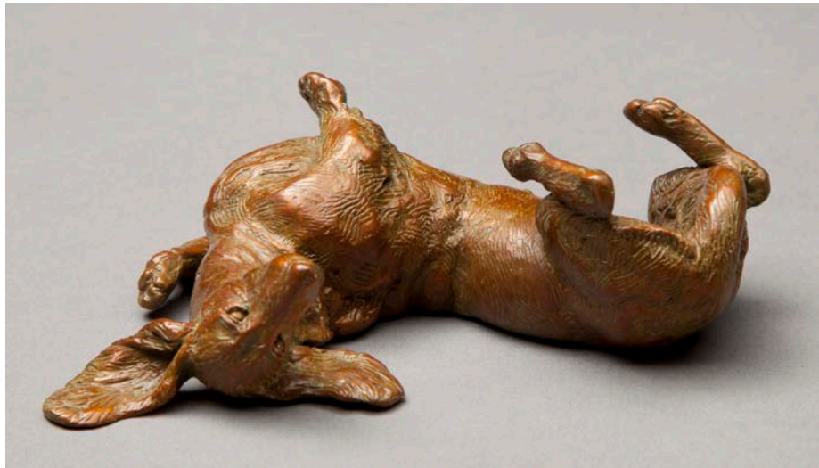
"A Good Life" Long 1:6 SCALE: 4 3/4"L x 1 3/8"H x 2 1/2"D, BRONZE ED. 50 & 5AP ©2011

MARCH 3, 2017 : I am excited to learn that "A Good Life" Long earned a Certificate of Merit as well as The Alphaeus P. Cole Memorial Award from the Salmagundi Club 108th Annual Thumb Box Exhibition. Thank you Jurors!