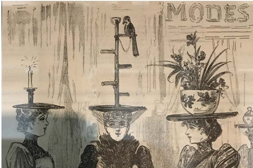
Caricatures of hats