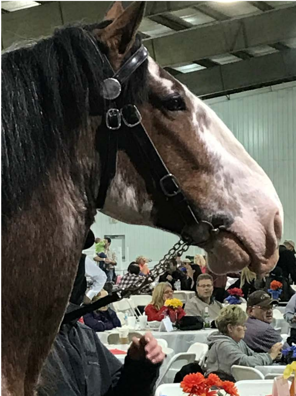
April 29th is a perfectly wonderful day!