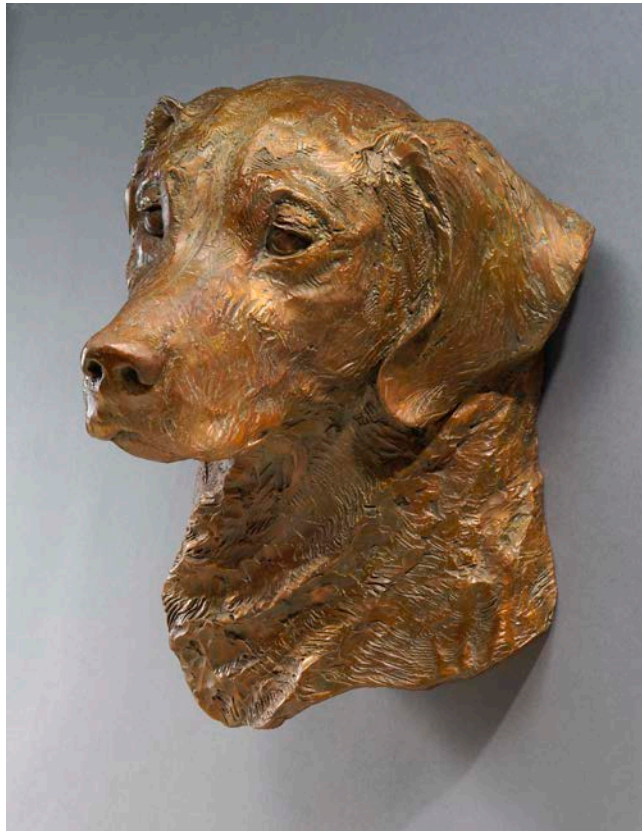
"Over the Rainbow"

10"H x 8 3/4"W x 8 1/2"D, BRONZE ED. 20 & 2 AP ©2005