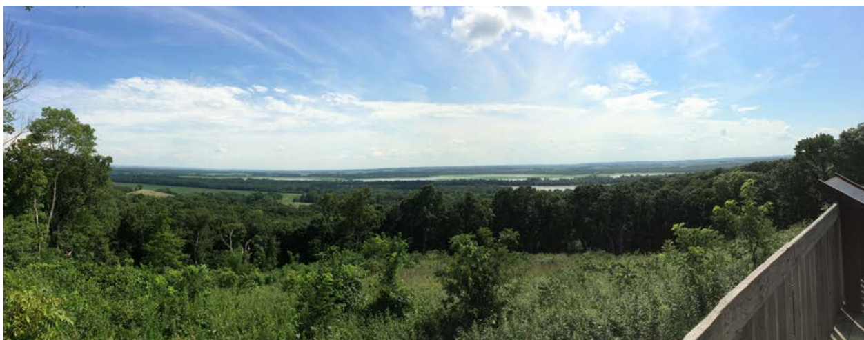
Mississippi River valley overlook near Pere Marquette State Park

We meander through rolling hills of farmland, find another ferry and cross the Illinois River into Illinois to find Pere Marquette State Park. The lodge reminds me of Yellowstone; it is huge and impressive. After lunch we take the Great River Road south to Elsah, IL, and tour the beautiful campus of Principia College.