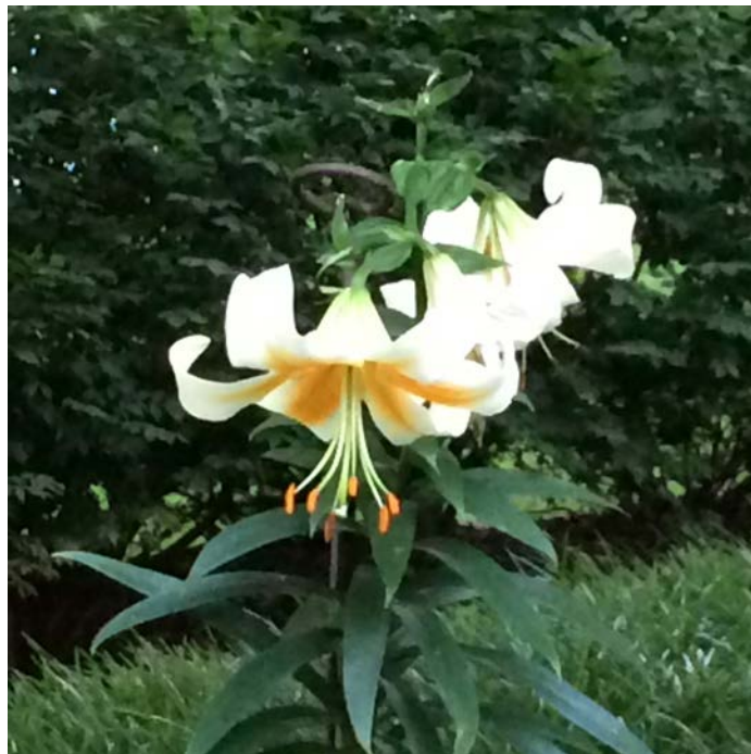
July 1, 2016: Chinese Trumpet Lily Regale Album in my garden. How I wish I could send you its fragrance!

OCT. 21 – DEC. 19, 2016 : Art Exhibit at Chesterfield City Hall, Chesterfield, MO