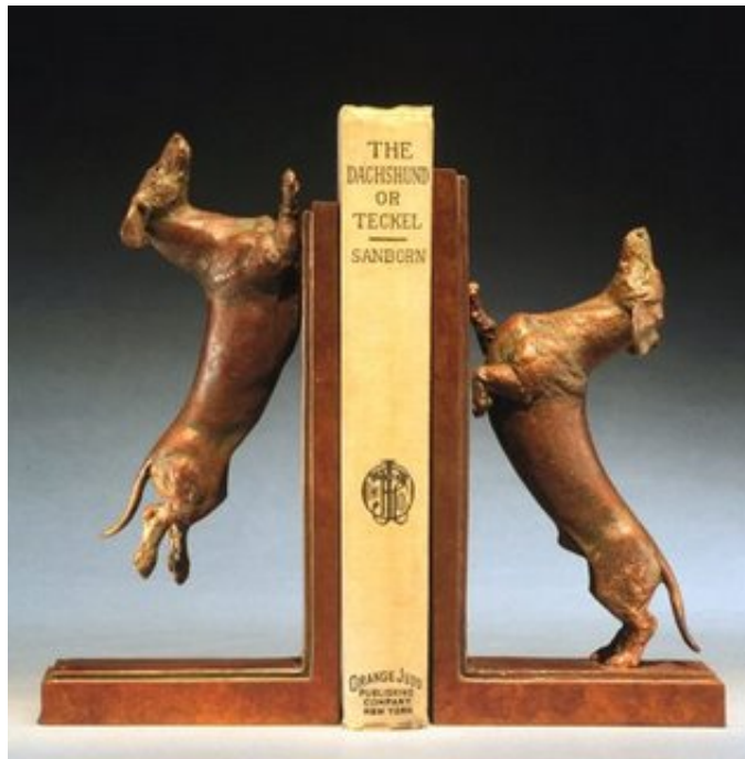
“Squirrel Season” Smooth