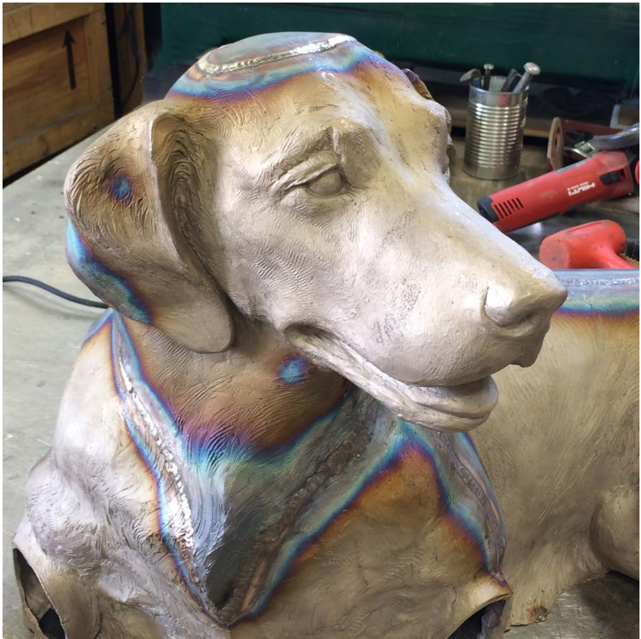
"Merry Sunshine" wearing her halo!

Please note the line where the neck is welded to the shoulders and chest. I think "Merry Sunshine" is beautiful as a portrait head as well as a full body bronze.