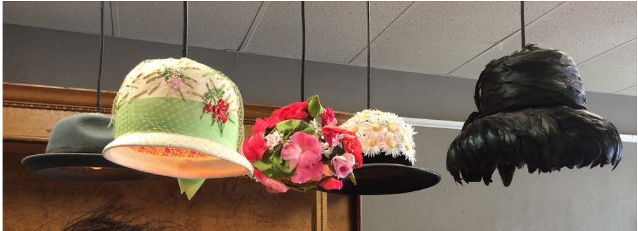
Highlights in an antique shop

JULY 15, 2016 : Historic Downtown Grand Junction Main Street.