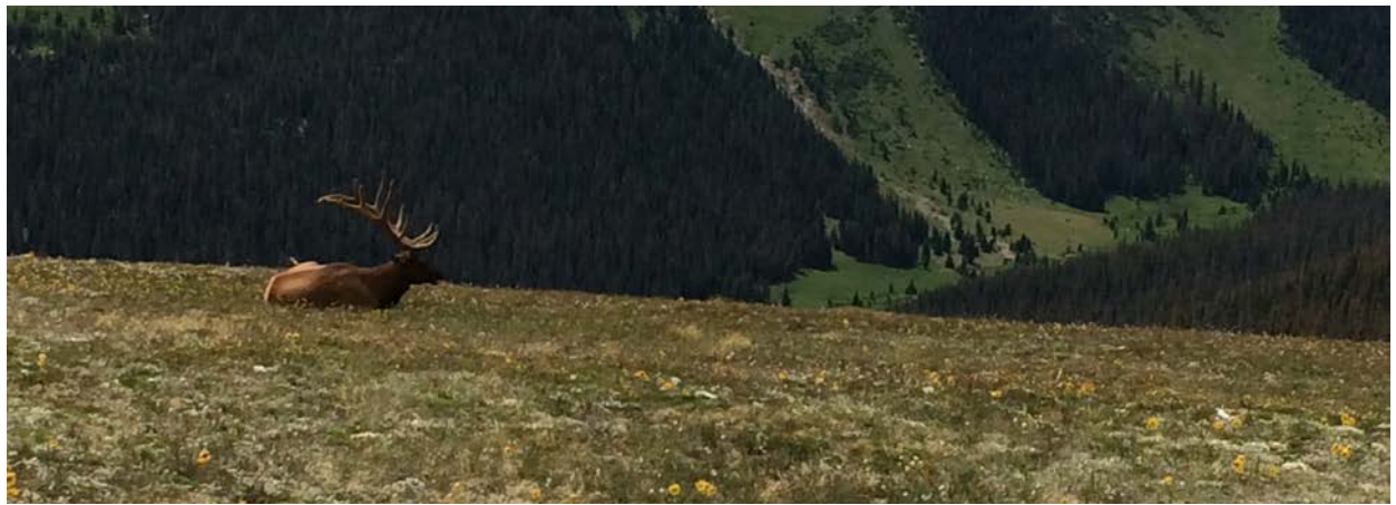
What a Rack!