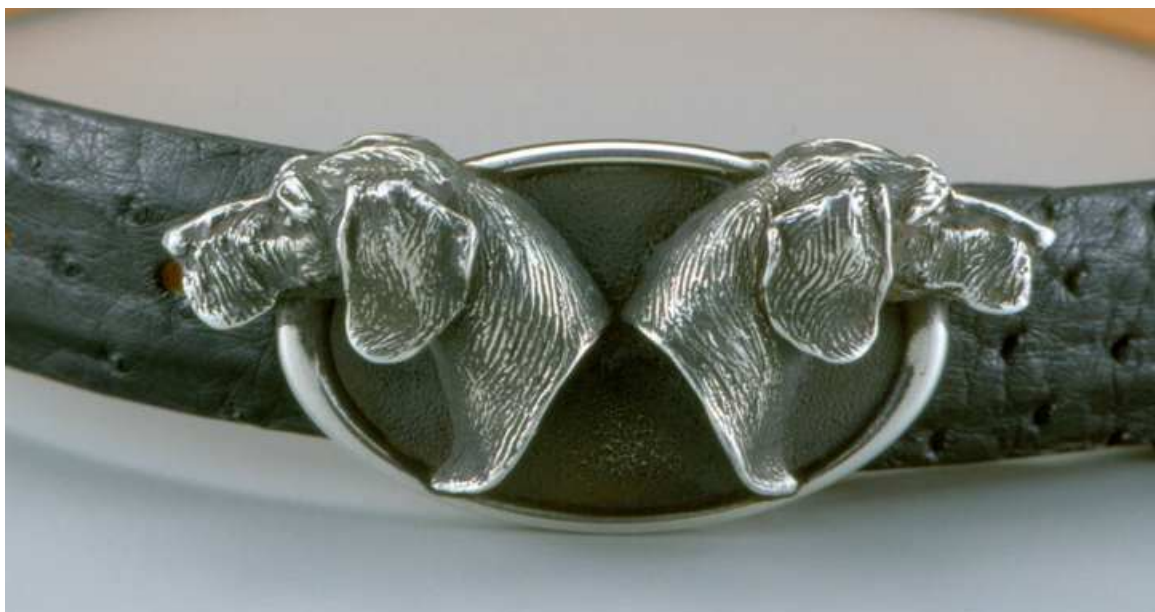
Over time, Mother Nature will give your “Coming & Going” sterling buckle a glowing patina.