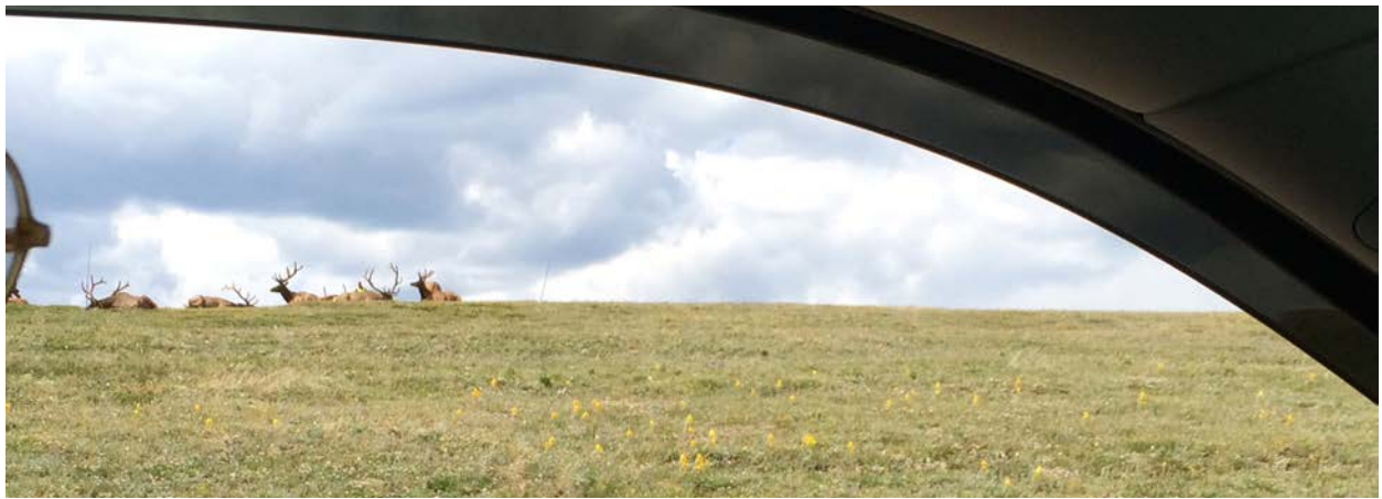
Along CO-34, elk are on the move, males with males and the females? Who knows where they are!