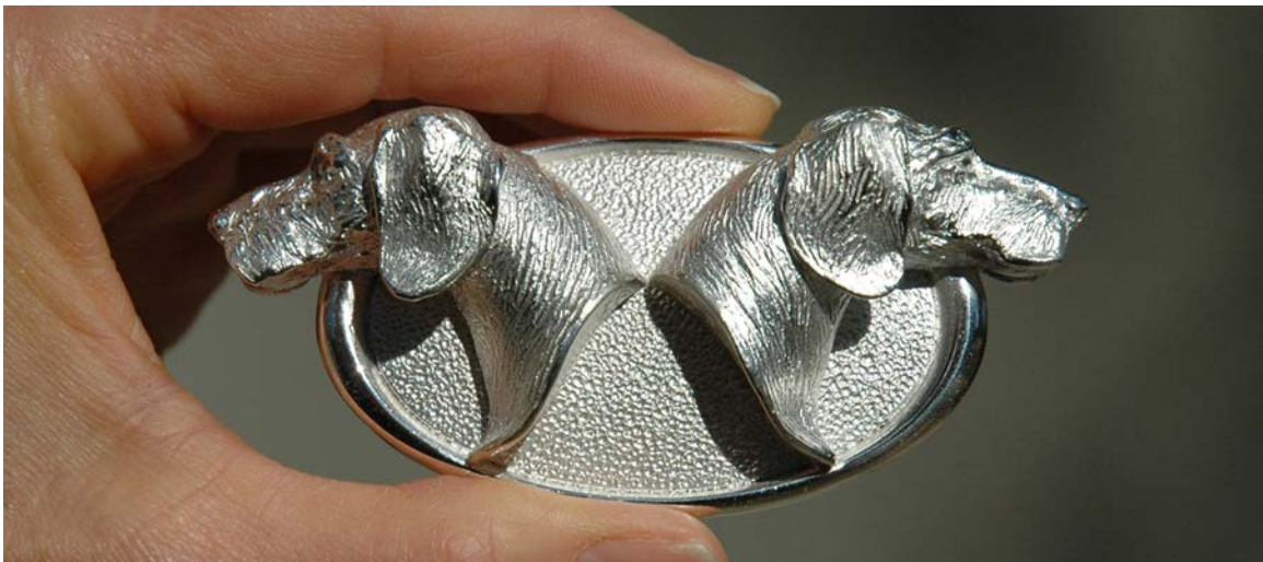
I hold a freshly cast “Coming & Going” Wire Buckle, ©2001