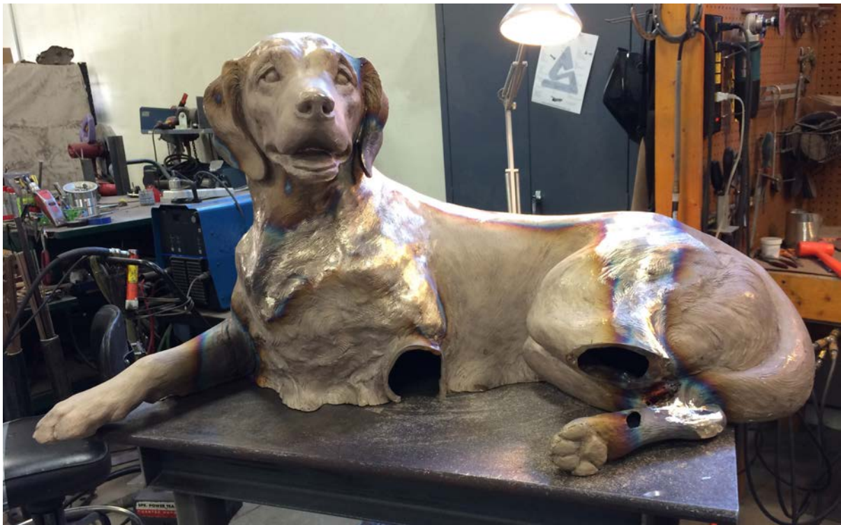
"Merry Sunshine" relaxes in Nancy's shop. Soon she will have four feet.