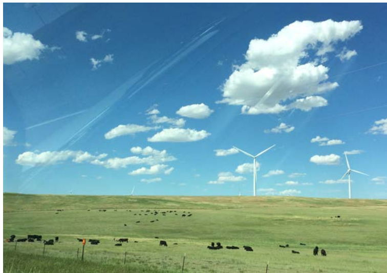
Happy cows graze north of Limon, CO, on State Road 71 looking north toward Brush, CO.

3:50PM : We are ready to go down the hill on I-70 to Limon, CO. Brian reports that it was 101 degrees 3-4 miles ago. Now it is 99 degrees – and - at about the Kansas/Colorado border, we lost 24mph winds from the south.