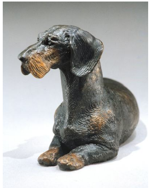
“Lord of the Couch” Wire, 1:6 scale, Wild Boar patina.