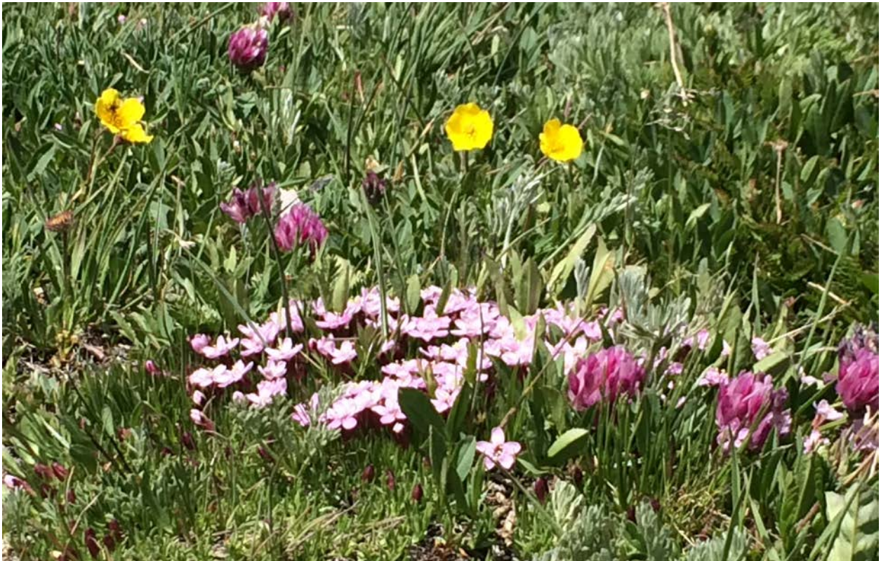
Yellow Cosmos and other wildflowers at the top of Trail Ridge.