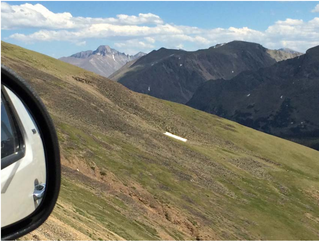
Long's Peak, elevation 14,114 feet, is the distant peak to the left above.