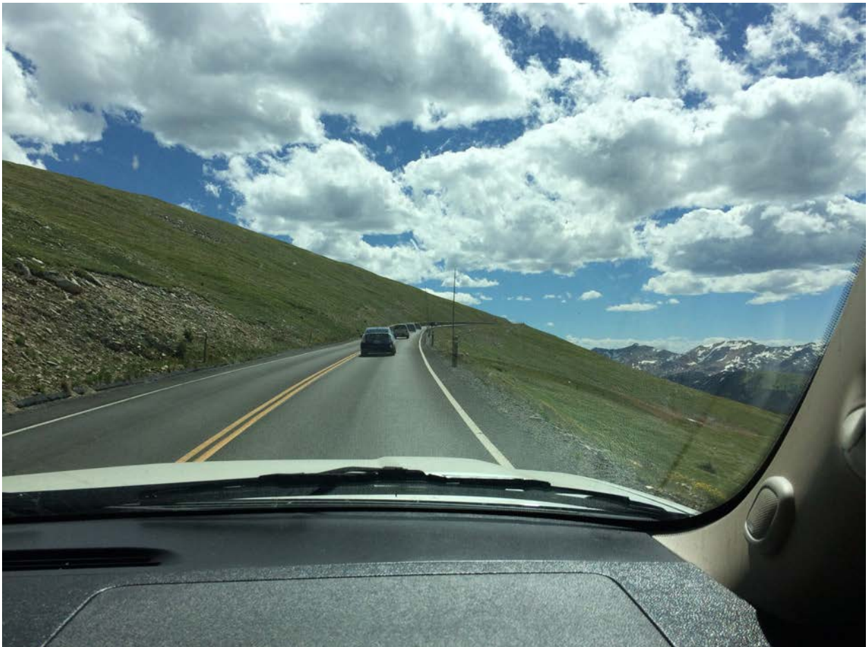
Trail Ridge Road, AKA Colorado-34, looking east toward Loveland.