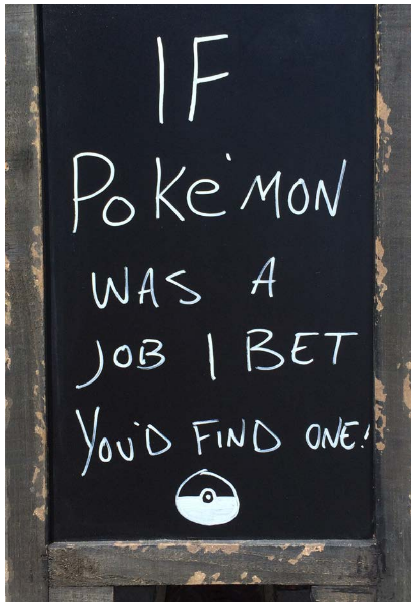
A sign on the sidewalk on Main Street, Downtown Grand Junction, CO.