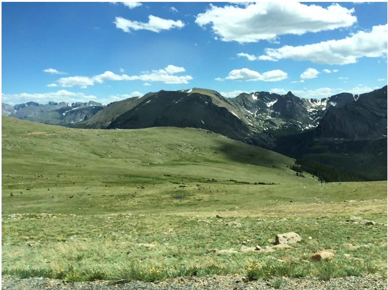
See the fifty or more elk sunning themselves?