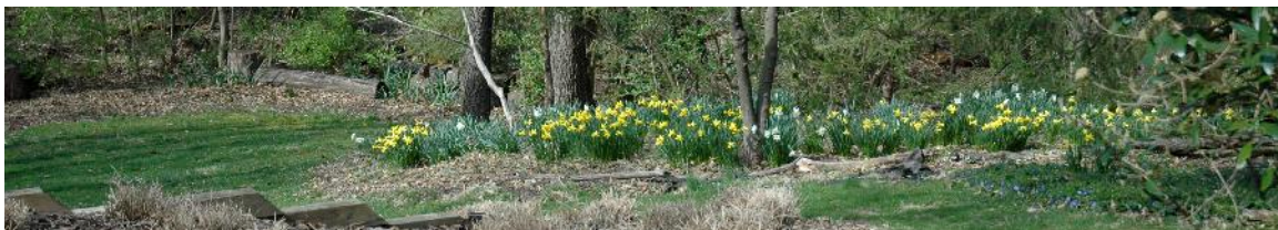
Daffodils in my March garden

MARCH 23 , On a far more peaceful note, daffodil Ice Follies joined February Gold to give glorious color to my garden. On this rainy March day, a friend and I visited the Missouri Botanical Garden for its annual Orchid Show.