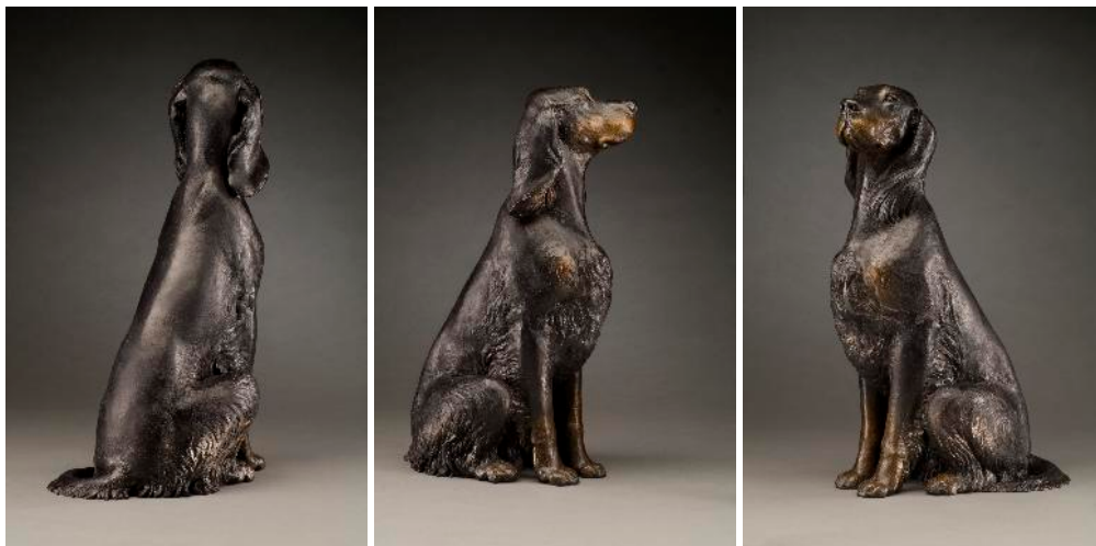
"Big Heart" Half life-sized Gordon Setter

JUNE 7-11 , Greeley, CO – Members of the Gordon Setter Club of America oohed and aaahed over " Big Heart " at their national specialty show.