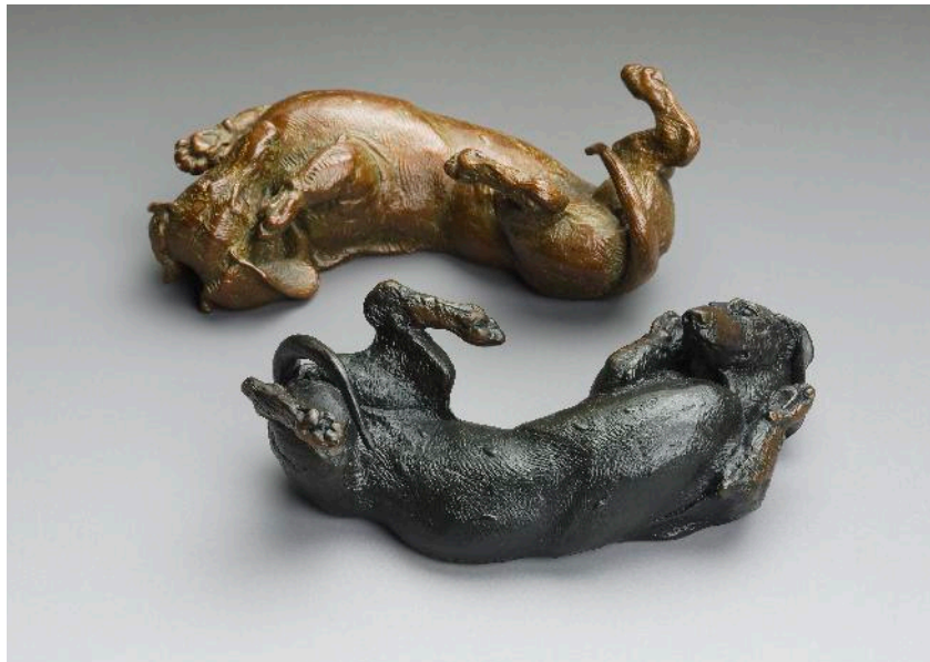
"Sweet Roll" Smooth. Shown in two patinas.

INFO@JOYBECKNER.COM :: WWW.JOYBECKNER.COM