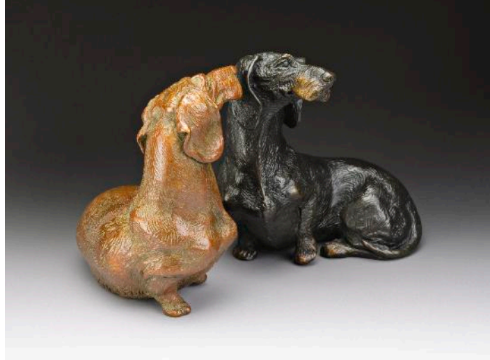
"Whispering Wires" AKA "So Good to See You" Wire. Shown in two patinas

As always, your deposit will hold your piece, or make sure I cast your piece for pre-holiday delivery. You will then be able to have what you want, and when you want it for that special person for the Holidays!