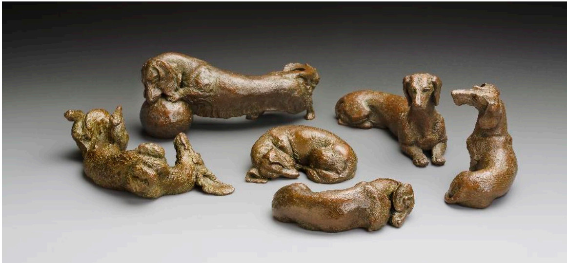
Clockwise: "Sunnyside Up" Long; "Life's a Ball" Long; "Lord of the Couch" Smooth; "So Good to See You" Wire; "Siesta" Smooth; Center: "Dreaming of Tomatoes" Long. All are also available in Black & Tan patina.

NEWS OF JOY :: VOLUME SIX, NUMBER TWO :: AUGUST 2010