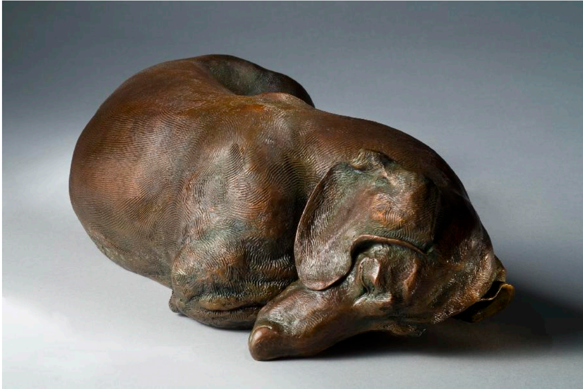
"Siesta" SS may be seen through May 2011 at Art on the Avenues, Wenatchee, WA.

JULY 2 , The Hudson Valley Art Association awarded "Siesta" SS, the Agop Agopoff Memorial Award, in their 79th Annual Exhibition, at the National Arts Club, NY.