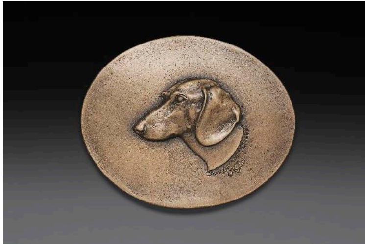
"Inspiration" Bronze two-sided medal

"Inspiration" was seen Aug. 10-15, 2010, in the "World's Fair of Money." AMSA with The ANA (American Medallic Sculpture Association with The American Numismatic Association) at Hynes Veterans Memorial Convention Center, Boston, MA. To learn more, please click here .