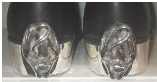
Custom Cats

APRIL 26 - MAY 24 , found me in a dizzying spin, creating a cartoon-like cat for a designer whose client, a professional football player, wanted a pair of identical custom cats made of sterling and soldered to custom sterling wrapped heels on his “Dream” boots. After creating the custom cats on heels wrapped in silver, I believe I can sculpt nearly anything. I will, however, always allow myself more time than I was given for this commission.